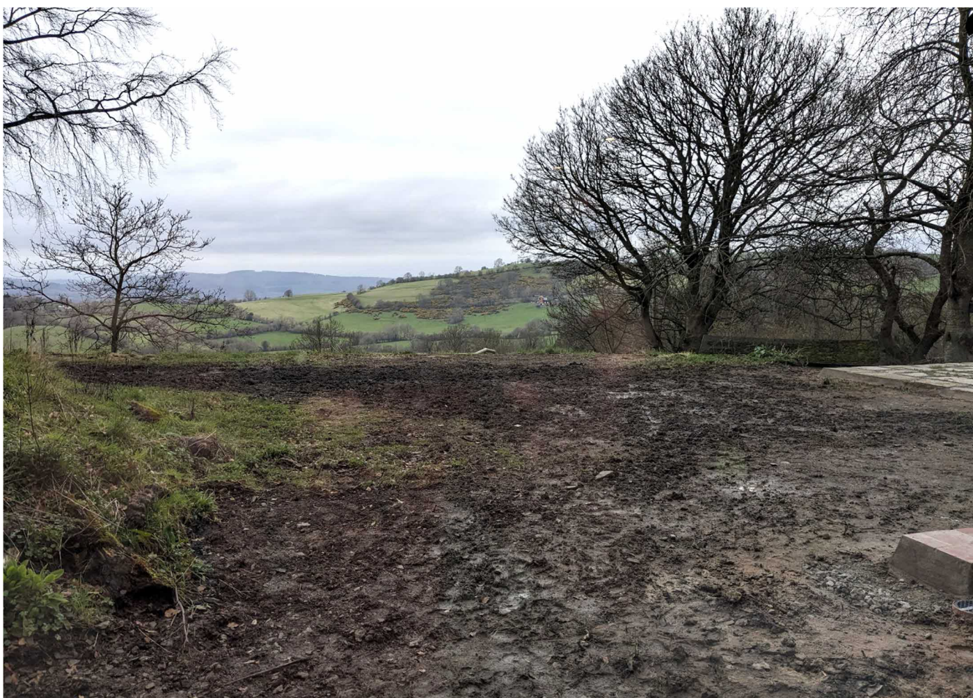
SITE OF WILD FLOWER PLANTING