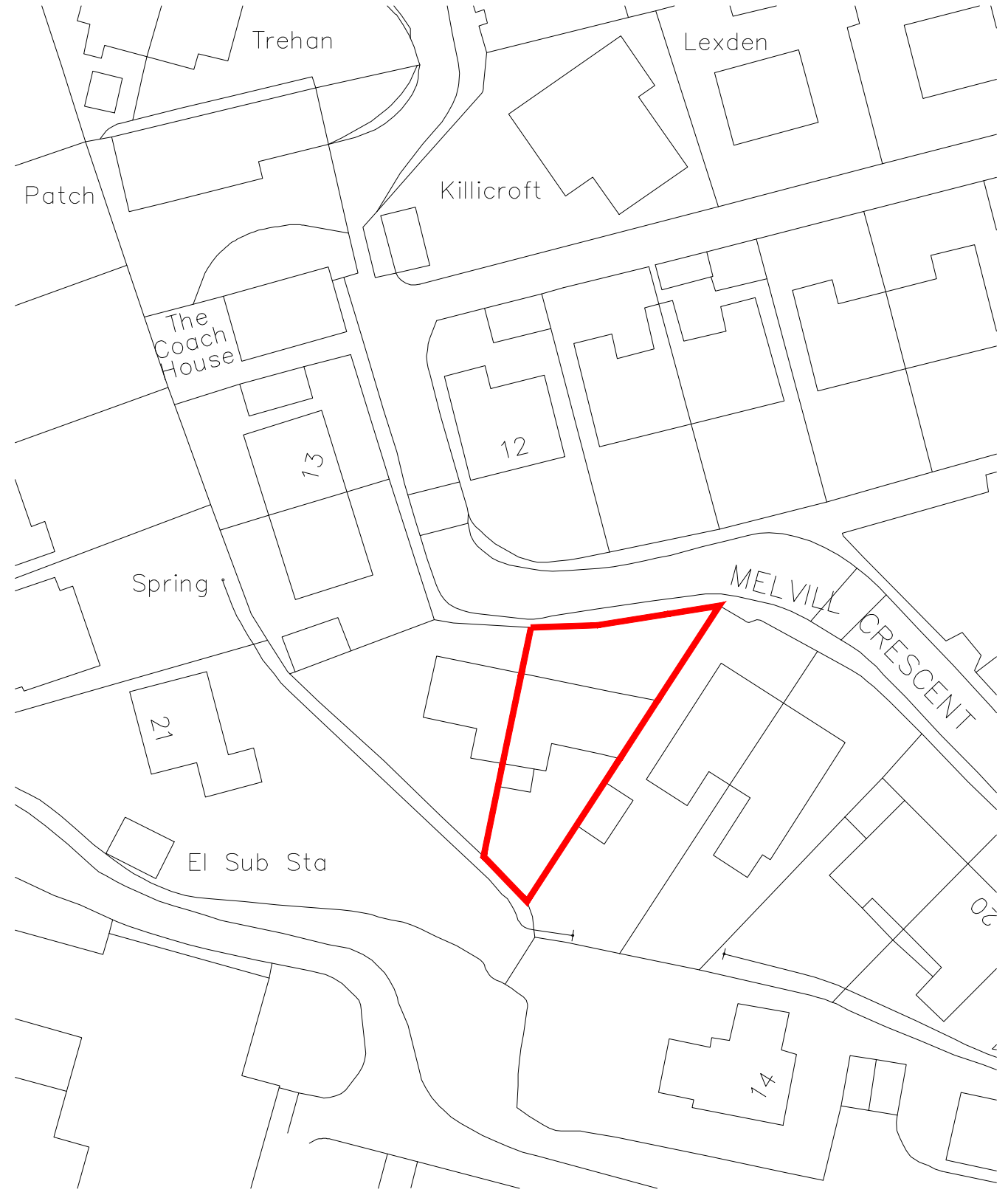
SITE BLOCK PLAN