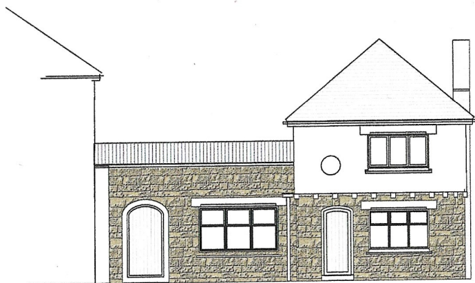
SOUTH EAST PROPOSED