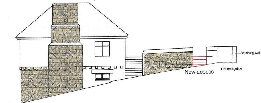
NORTH EAST PROPOSED