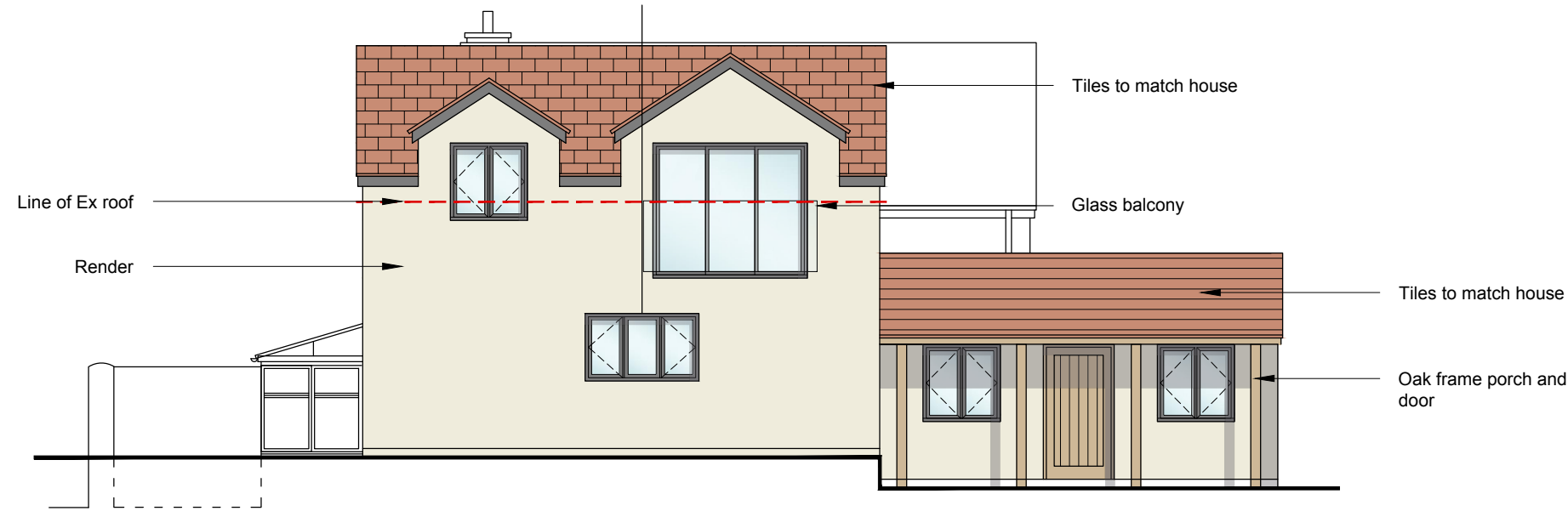
○ South Elevation as Proposed Scale: 1:100