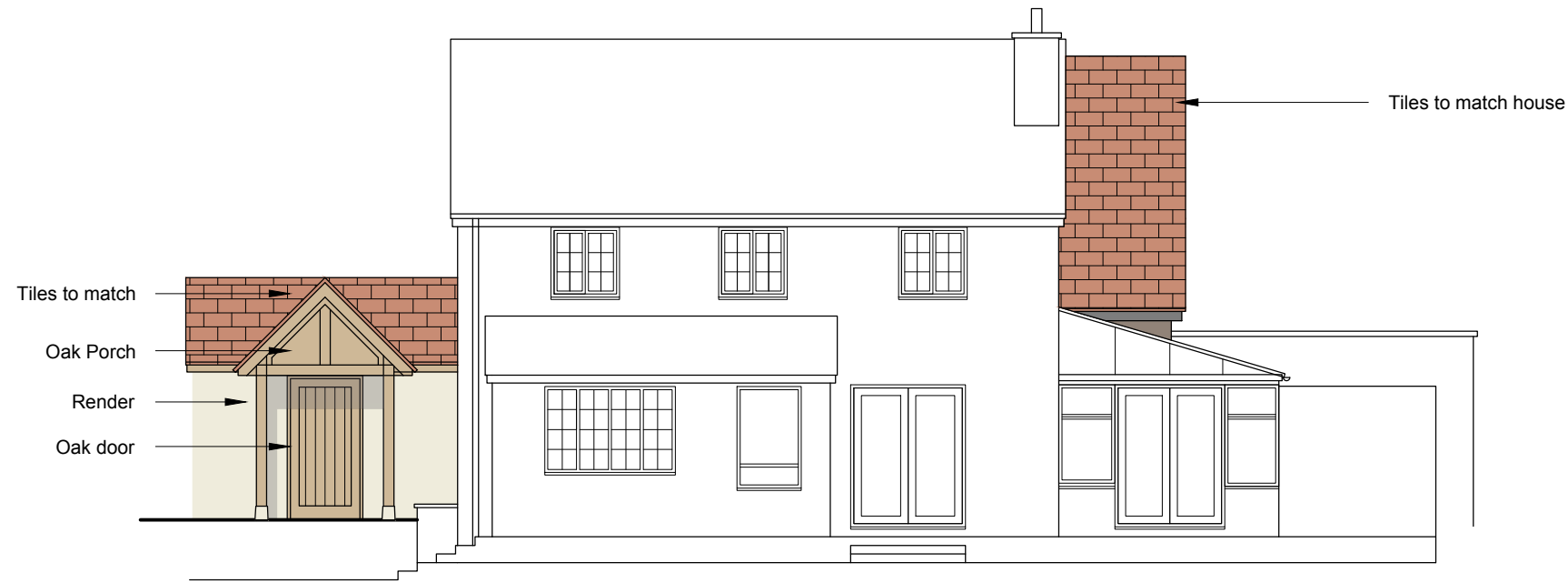
○ North Elevation as Proposed Scale: 1:100

New single storey porch, first floor extension and alterations to parking area Conygar Cottage, Norton Woods Lane, Clevedon