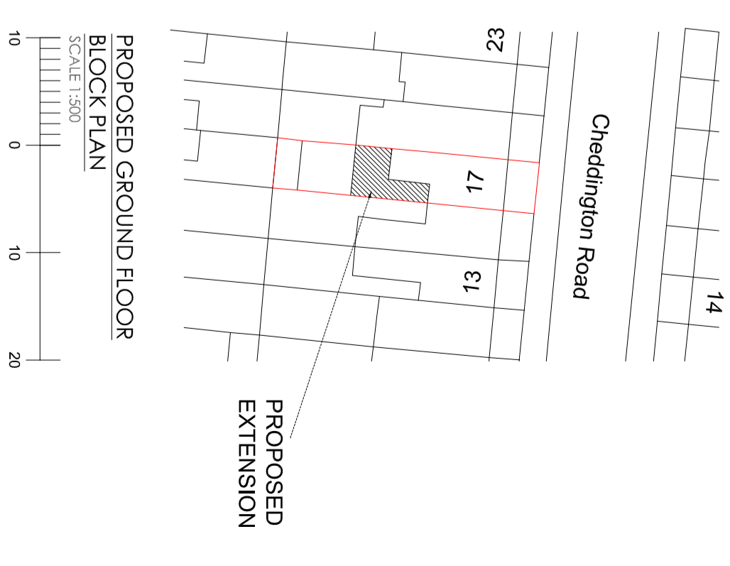
PROPOSED GROUND FLOOR BLOCK PLAN SCALE 1:500