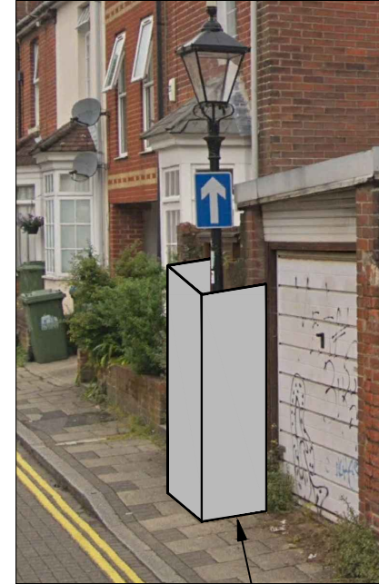
LANTERN TO BE BOXED USING 18mm THICK TREATED BOARD FOR PROTECTION