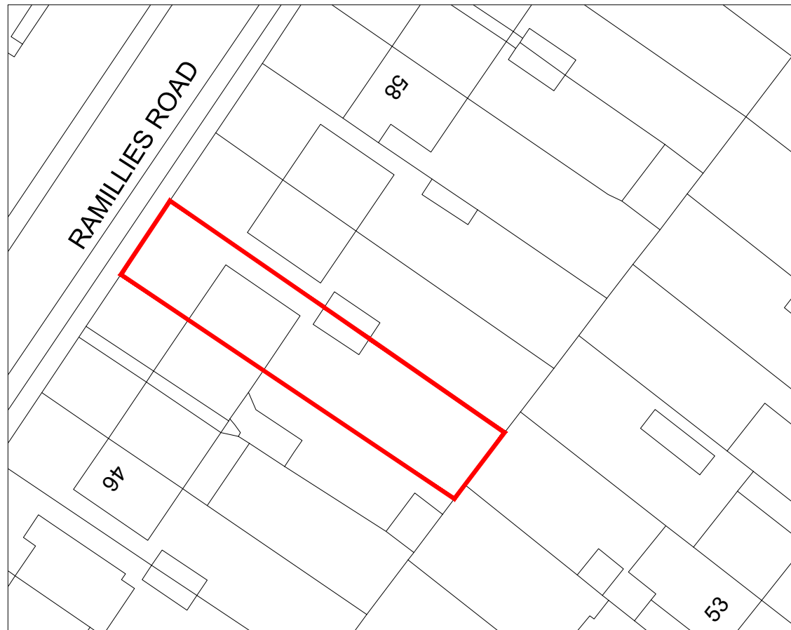
EXISTING BLOCK PLAN - 1:500