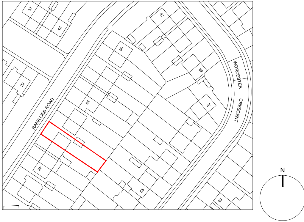
EXISTING LOCATION PLAN - 1:1250