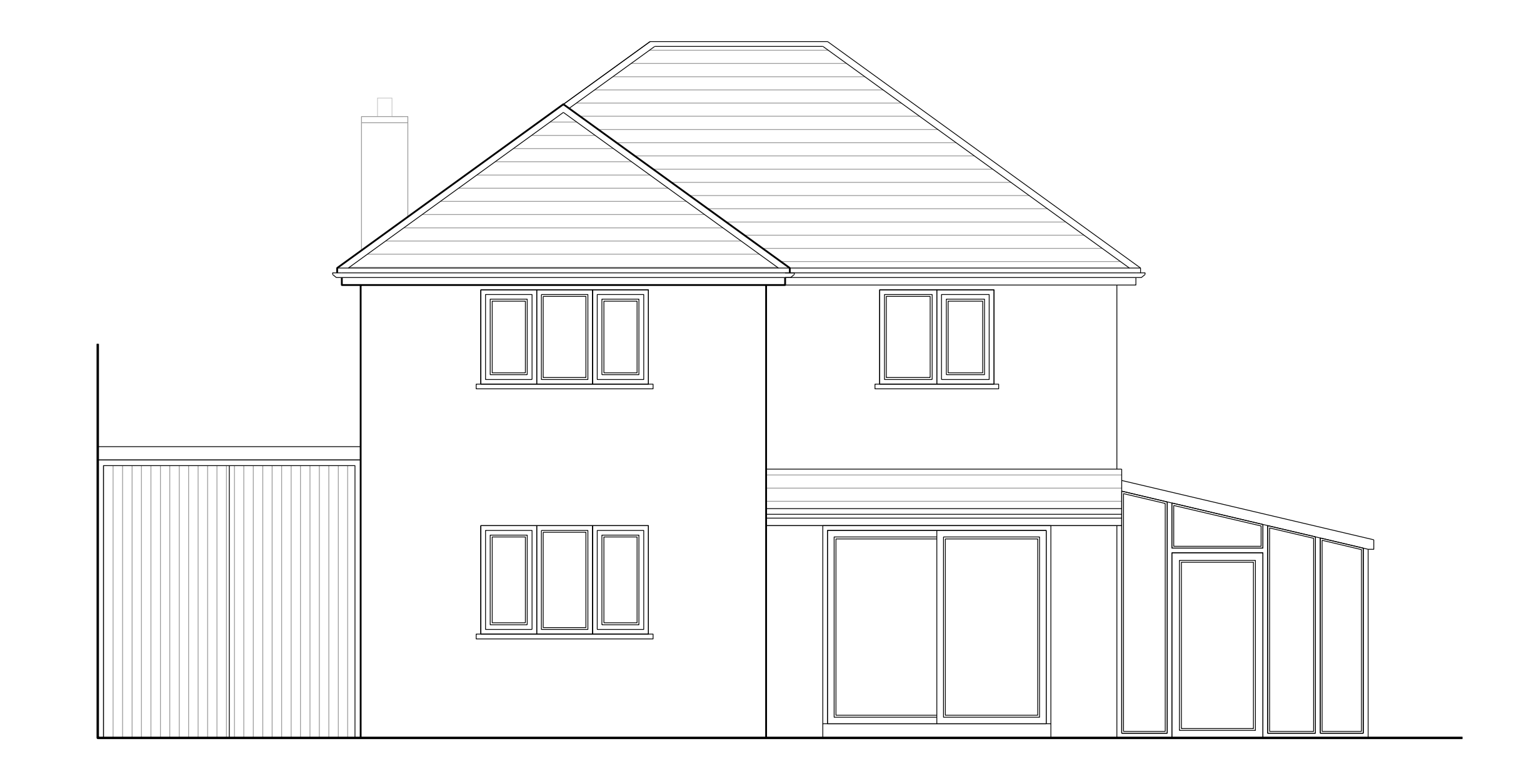
Existing Side Elevation Existing Front Elevation