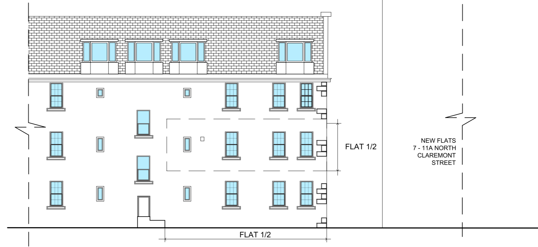
REAR ELEVATION 1:200