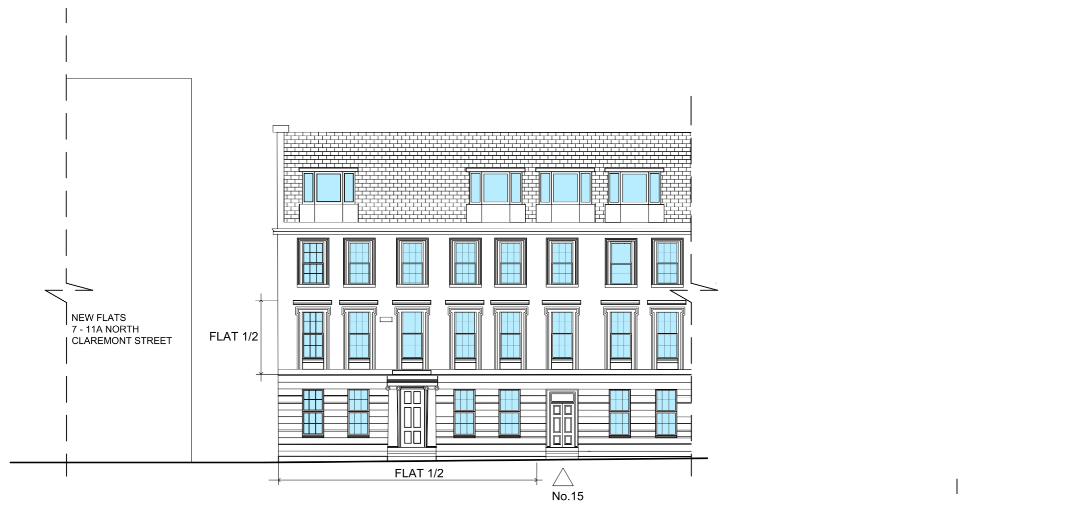
FRONT ELEVATION 1:200

DIMENSIONS N.B any variations between stated dimensions and site dimensions should be reported to the Architect prior to work being executed.