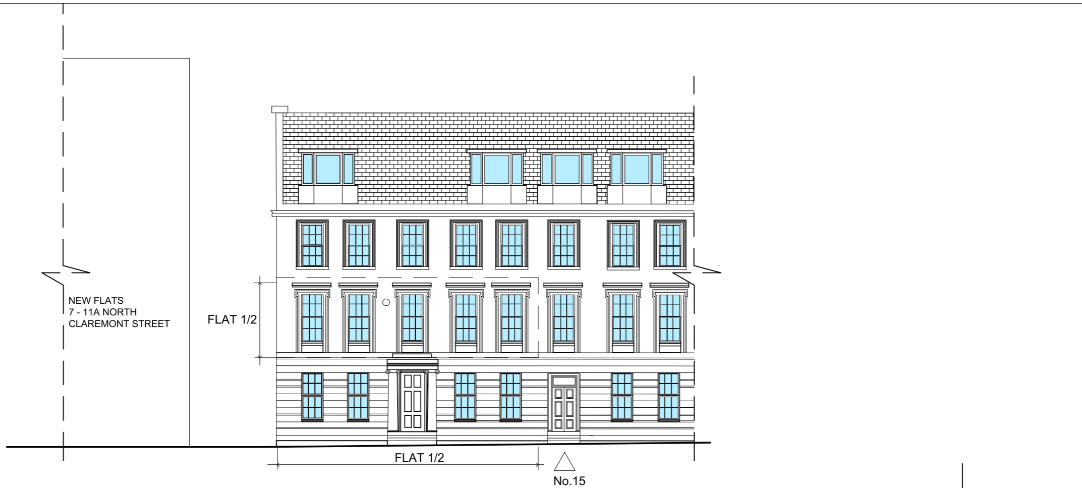
PROPOSED FRONT ELEVATION 1:200

DIMENSIONS N.B any variations between stated dimensions and site dimensions should be reported to the Architect prior to work being executed.