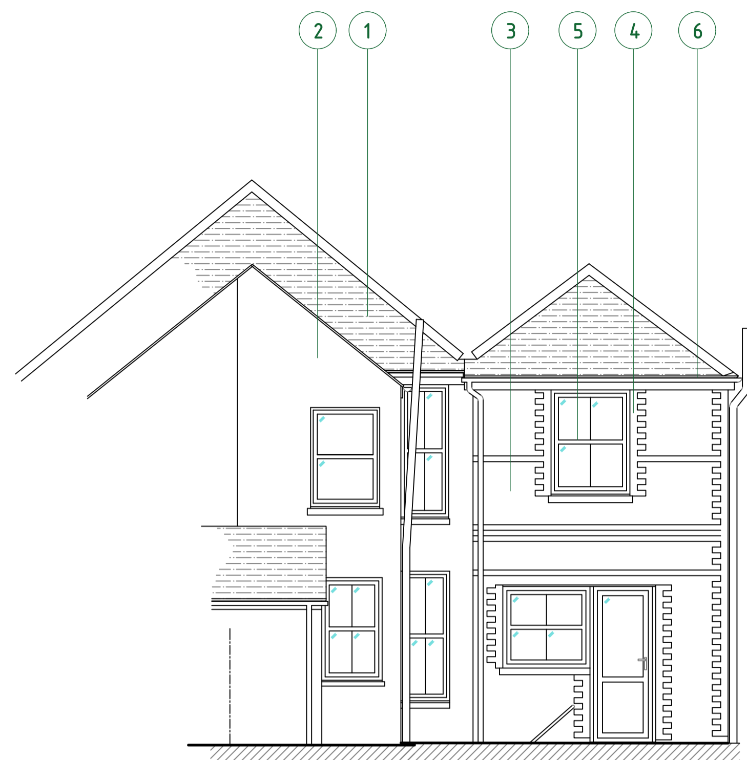
EXISTING SOUTH (REAR) ELEVATION