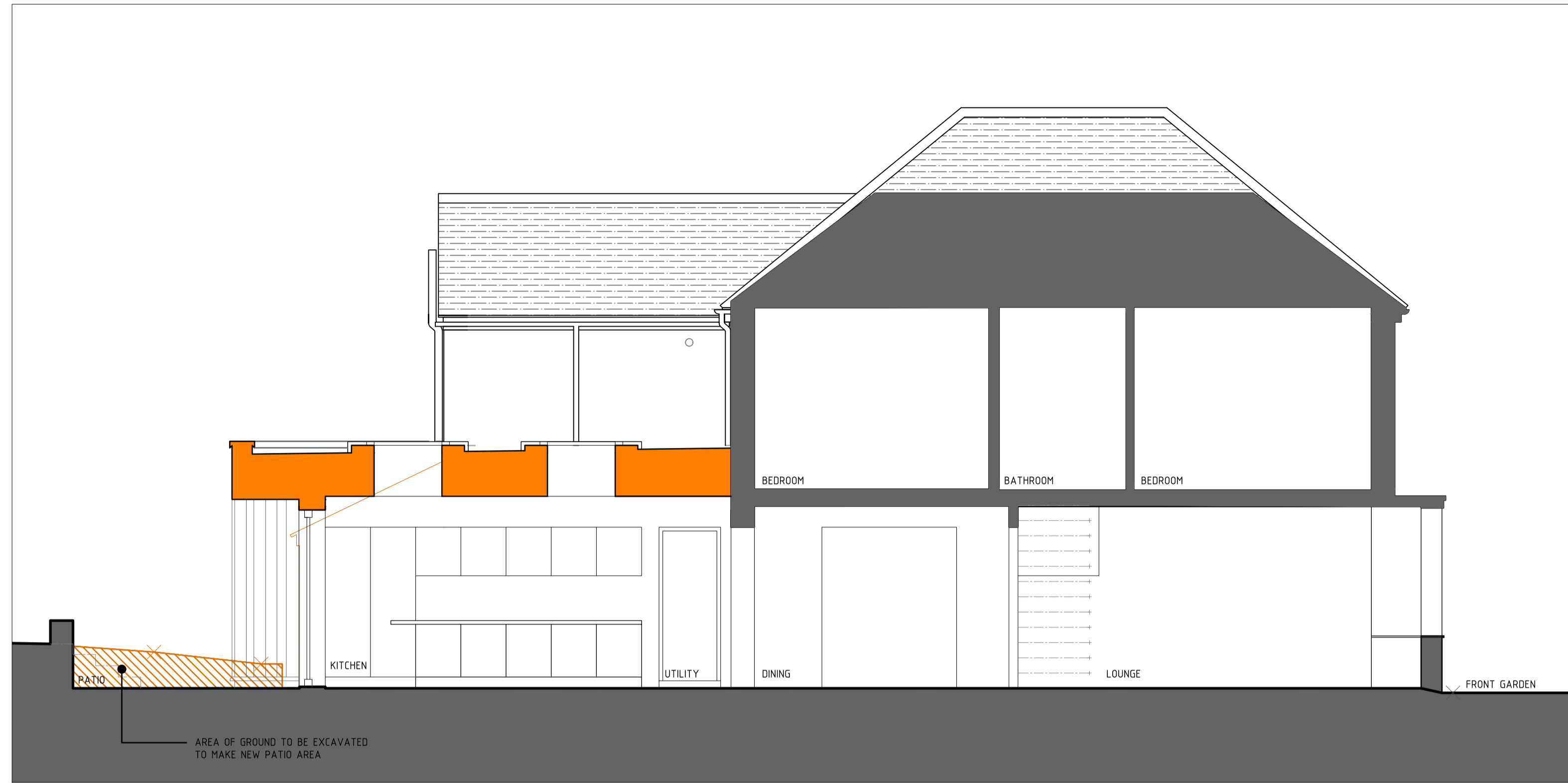
PROPOSED CROSS SECTION