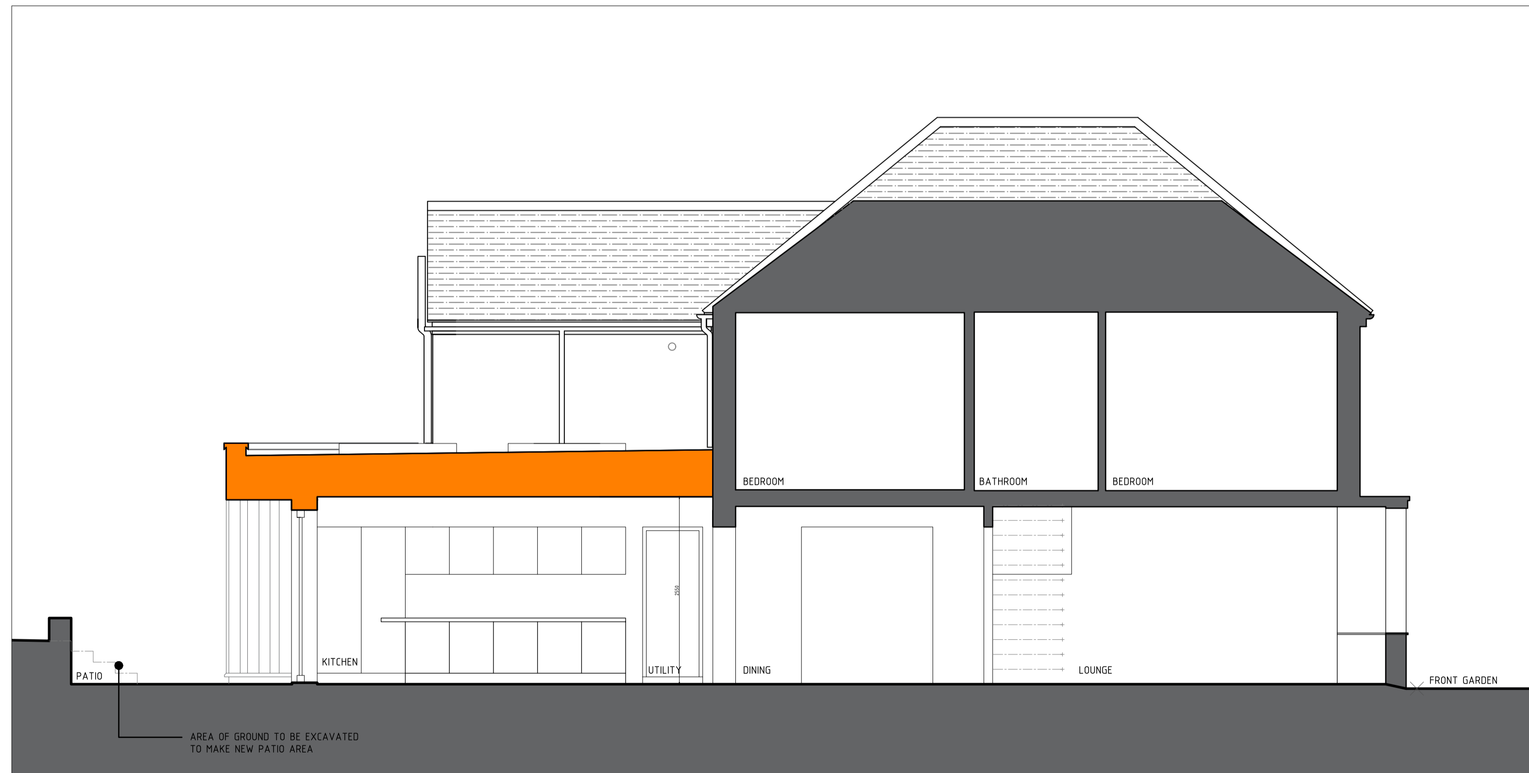
PROPOSED CROSS SECTION