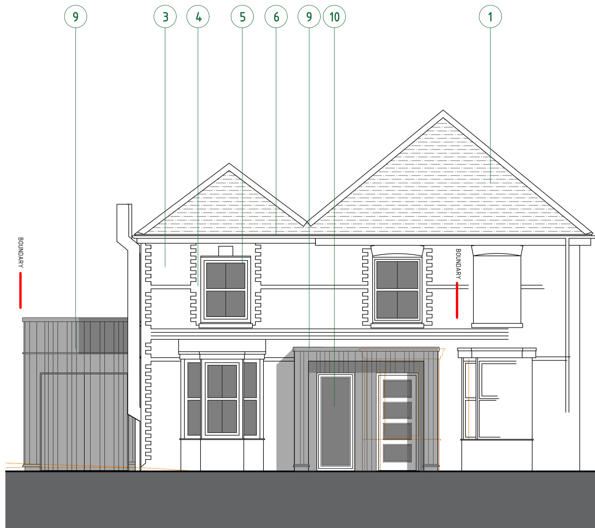
PROPOSED NORTH (FRONT) ELEVATION