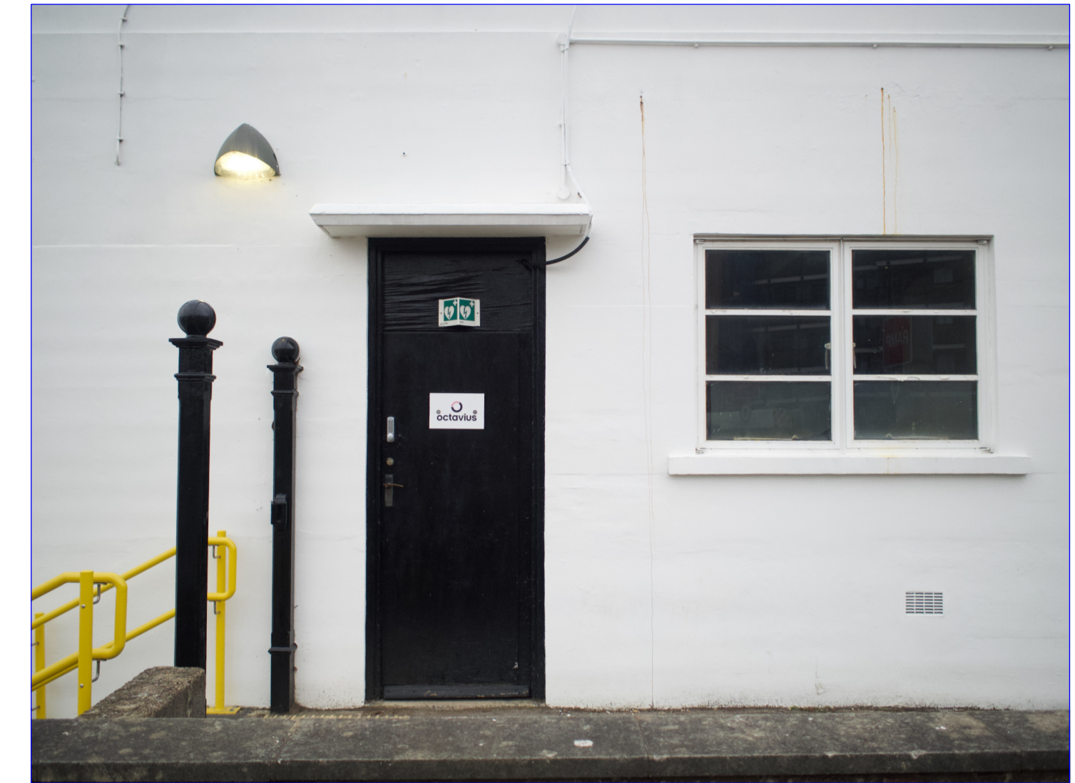
02 Existing canopy above side entrance 1501

Existing canopy above. Refer to top right image. Approximately 1400mm (L) x 270mm (W) x 107mm (D)