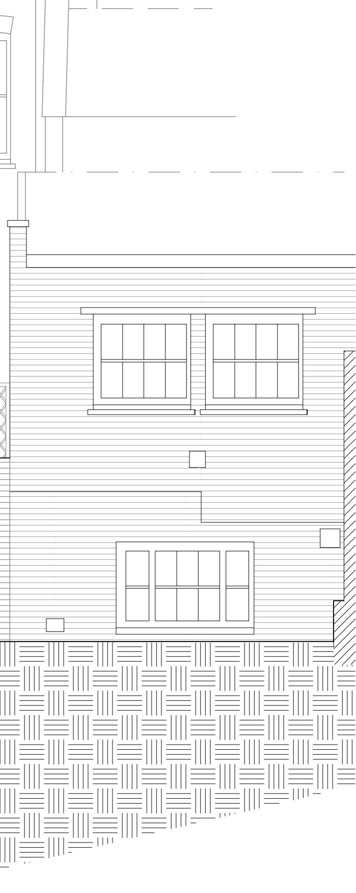
1 SECTION AA - EXISTING SCALE: 1:50