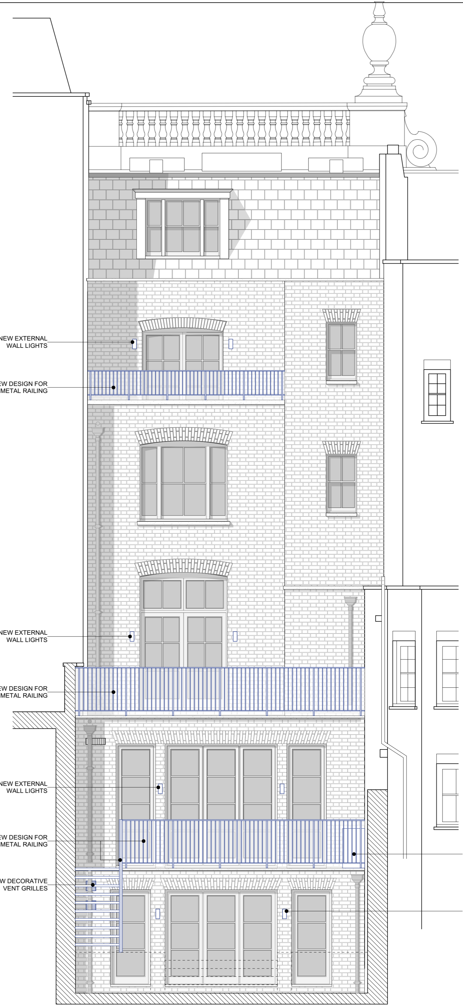
2 NORTH ELEVATION - PROPOSED SCALE: 1:50

COPYRIGHT 2024 STANHOPE GATE ARCHITECTURE