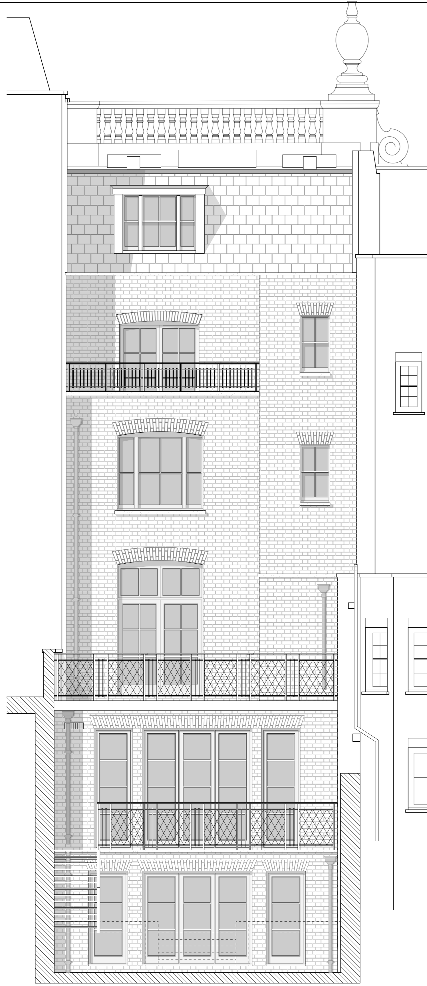
1 NORTH ELEVATION - EXISTING SCALE: 1:50