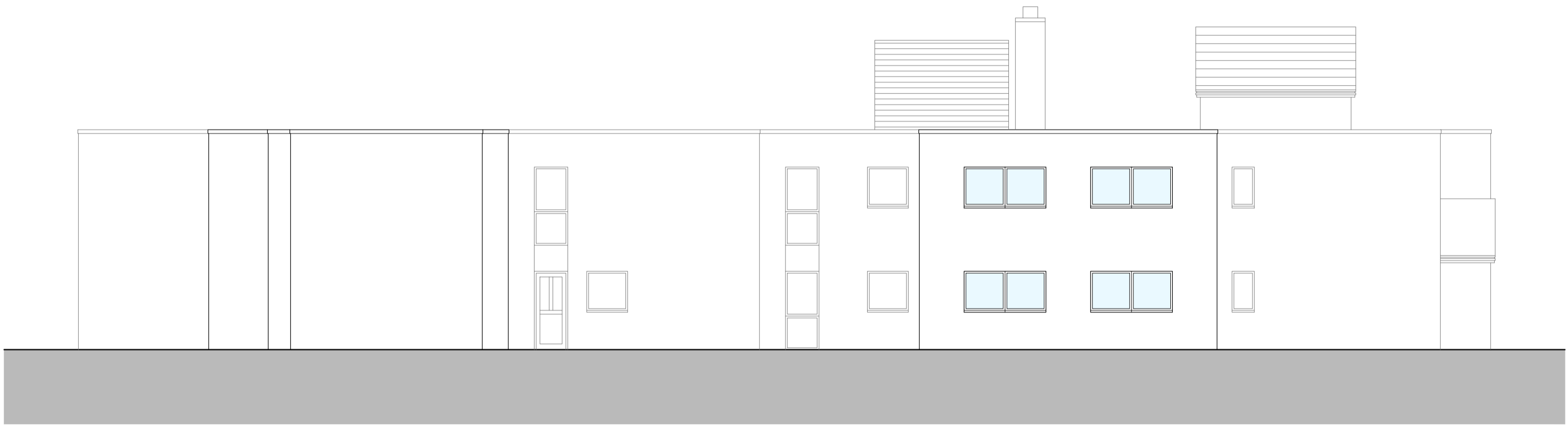
EXISTING EAST ELEVATION TO WORRALL STREET 1:100