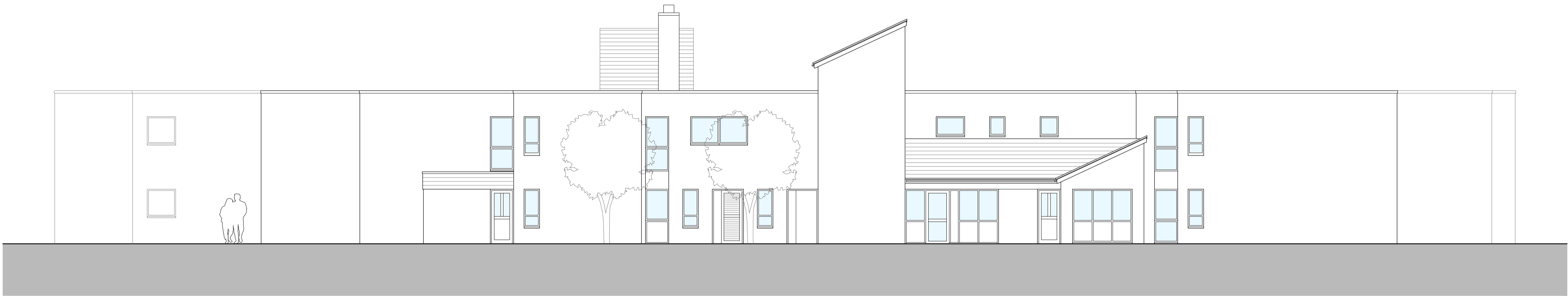
EXISTING NORTH ELEVATION TO LOMAS STREET 1:100