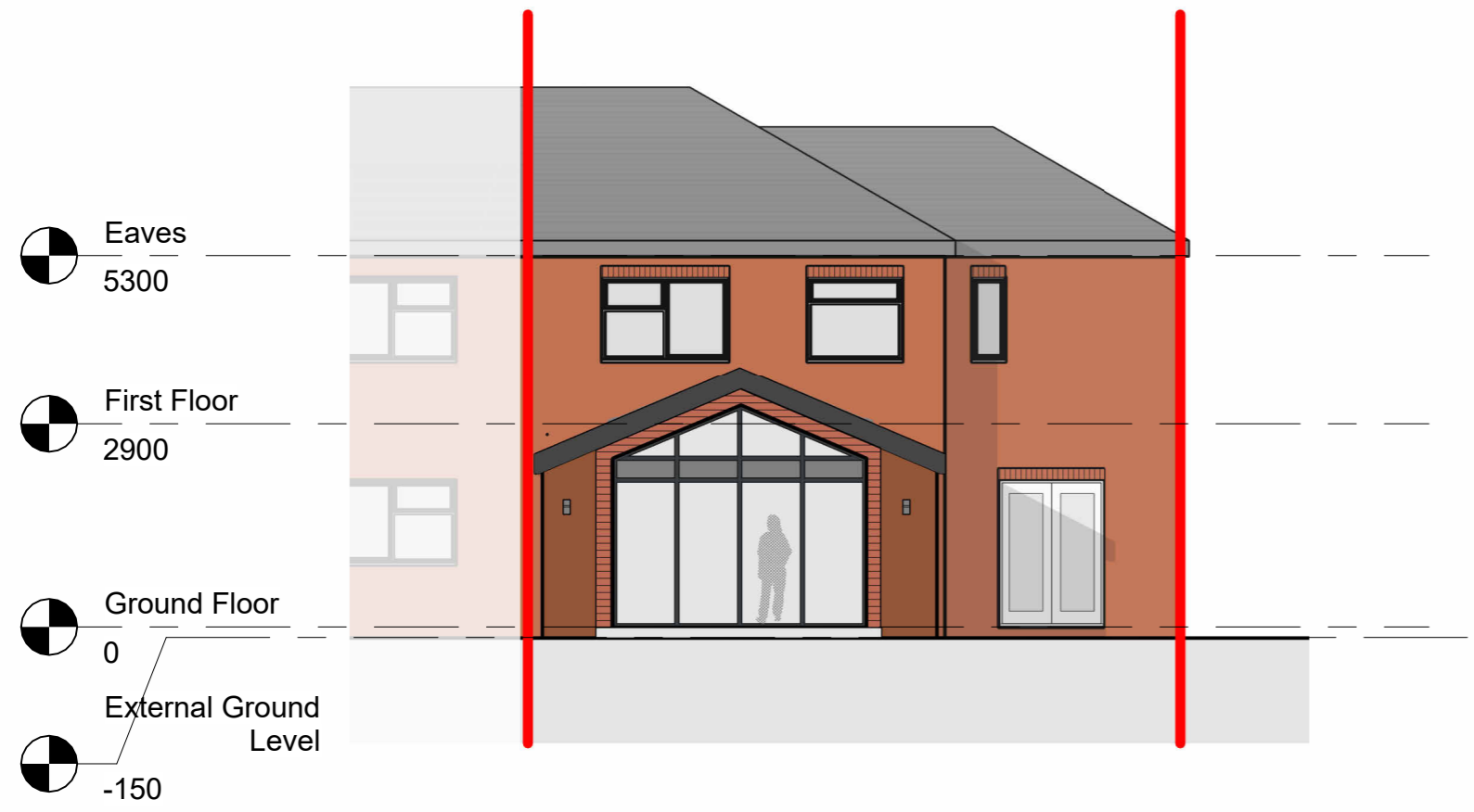
Proposed South East Elevation 1 : 100

CLIENT Tyler Denton & Sophie Miller PROJECT 53 Plantation Drive, York, YO26 6AD DRAWING TITLE Proposed Elevations - Sheet 1 STATUS S4 - Planning Proj Ref Origin Zone Level Type Role Num Status Rev 23017 BAS 00 XX DR A 20400 S4 P2 Sheet Scale Issue Date Drwn by Ckd by A3 1 : 100 17-03-24 AB AB