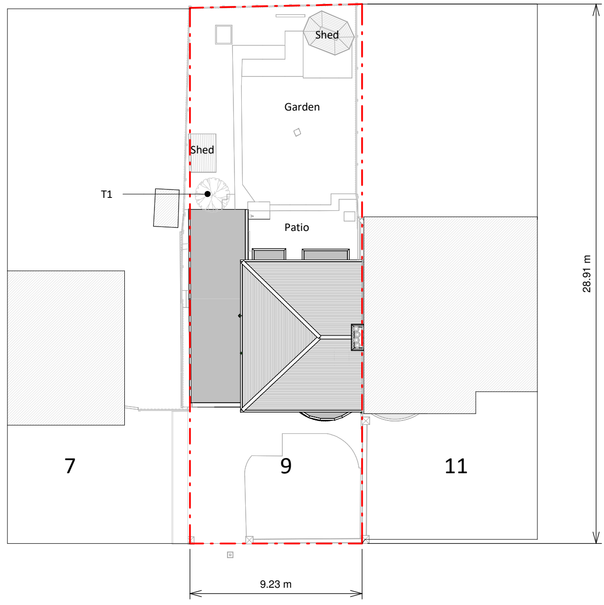
Existing Block Plan