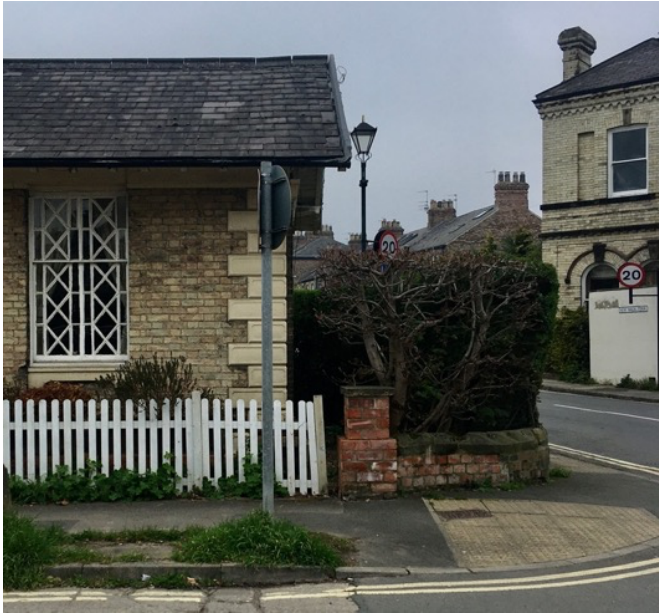
The Lodge and Lighthorseman PH White / cream brickwork