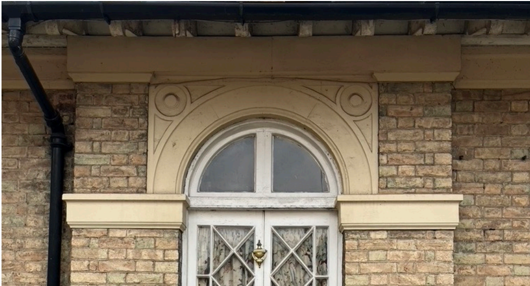
225mm cornice at Grange Garth

The sizes will fit with the brick coursing and detail of the neighbouring properties, that is 150mm high at cill levels and 225mm at heads.