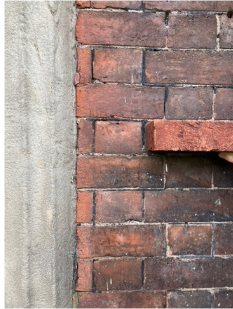
Materials at 126 Fulford Road With Hunsingore sample brick

White/cream clamp bricks can be seen on historic buildings within the conservation area, such as The Grange and Light Horseman PH and is also used for details on adjacent properties.