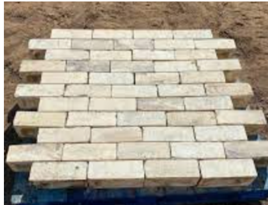
Salvaged white bricks for details