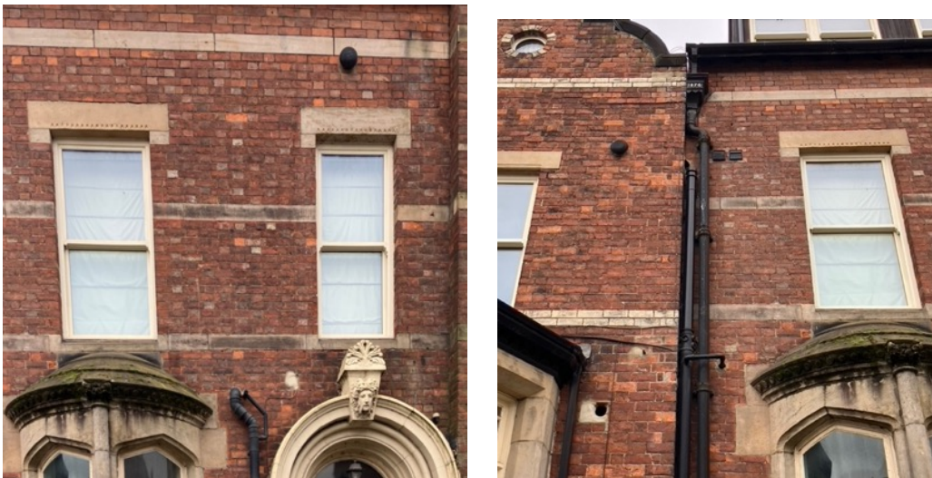
150mm string courses and decorative stone work at nos.126 and128 Fulford Rd