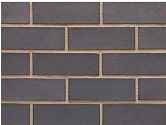
Blue engineering bricks for plinth

Lower courses below DPC to be in 5 courses blue engineering bricks, to represent the raised ground floor level, providing a plinth similar in height to that of the adjoining property.