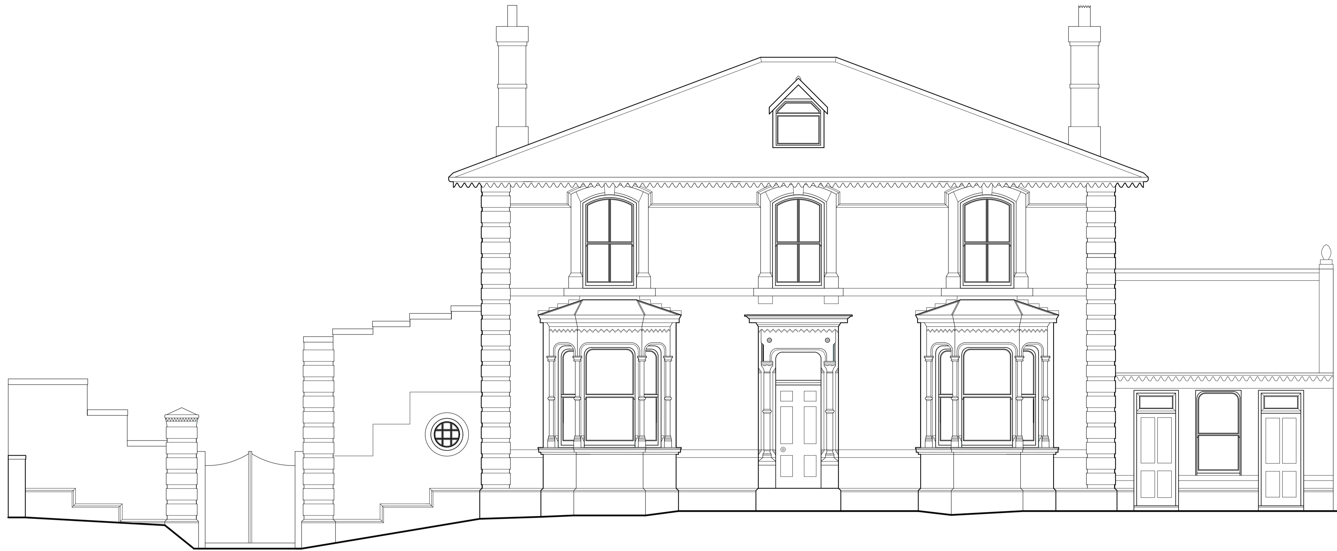
EXISTING FRONT ELEVATION 1:50

NOTE: ALL WINDOWS TO THE FRONT ELEVATION (EXCLUDING THE DORMER WINDOW) TO BE REPLACED WITH PROFILES, MATERIALS AND COLOUR TO MATCH EXISTING, WITH THE ADDITION OF HERITAGE DOUBLE GLAZING UNITS. PLEASE REFER TO SPECIALIST MANUFACTURER'S SECTIONS AND SPECIFICATION FOR FURTHER INFORMATION WHICH IS TO BE READ IN CONJUNCTION WITH THIS DRAWING AT ALL TIMES.