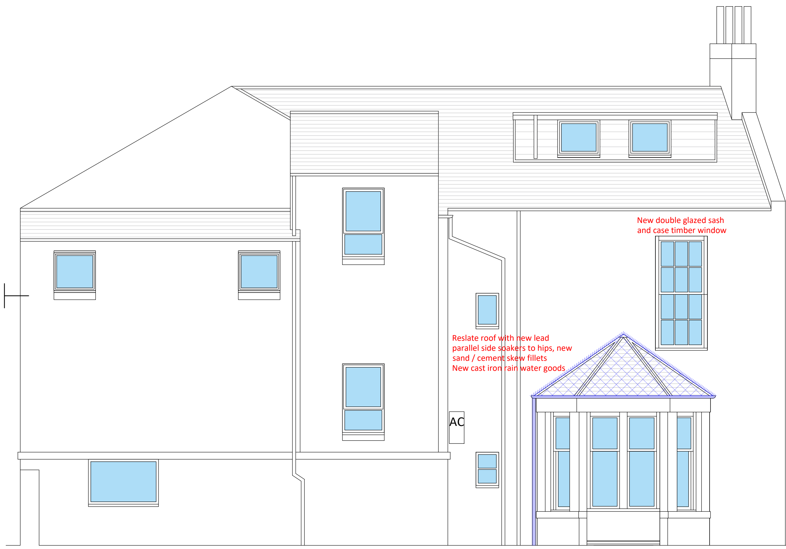
Proposed Rear Elevation 1:50