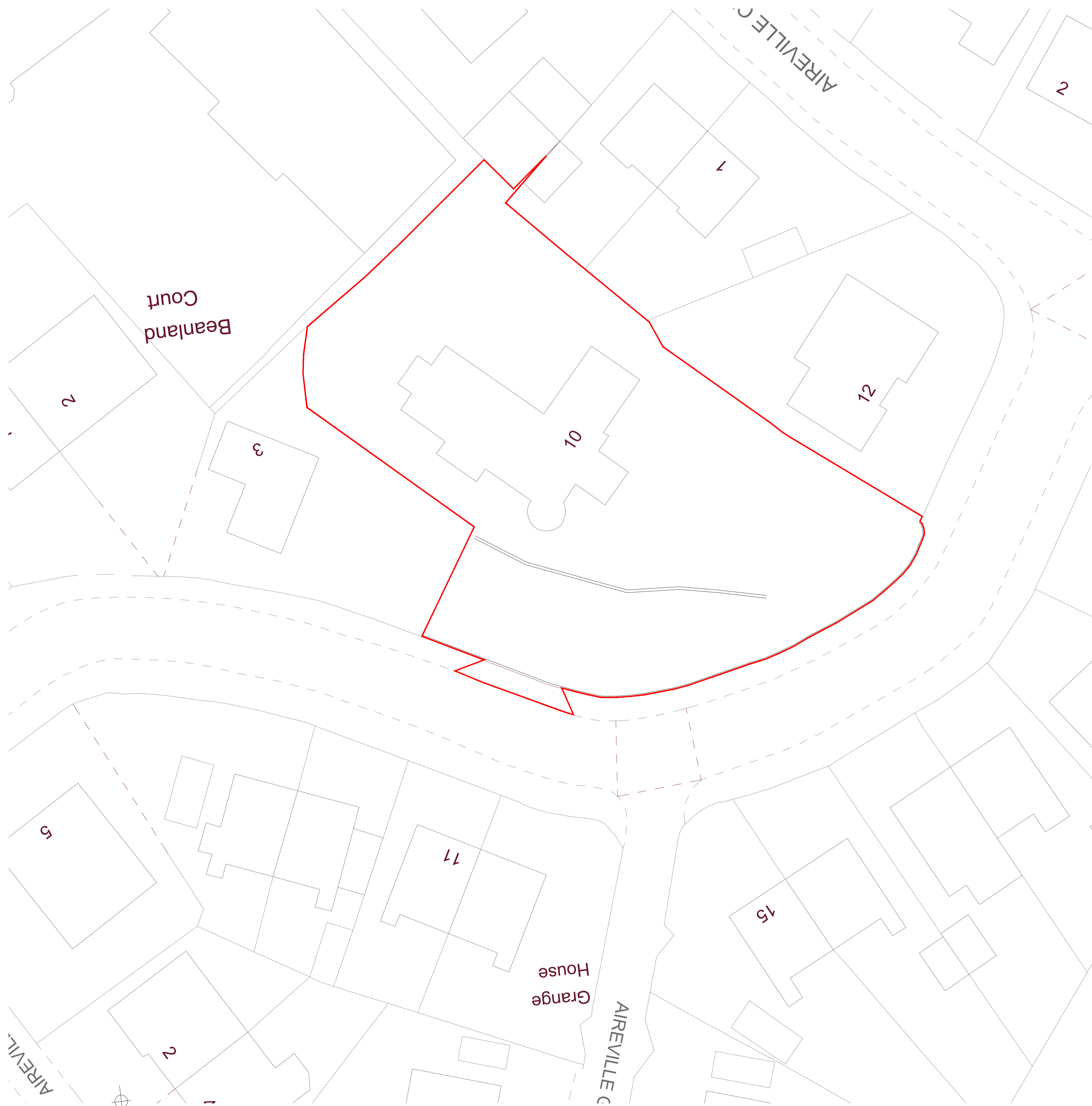
Site Plan 1:200