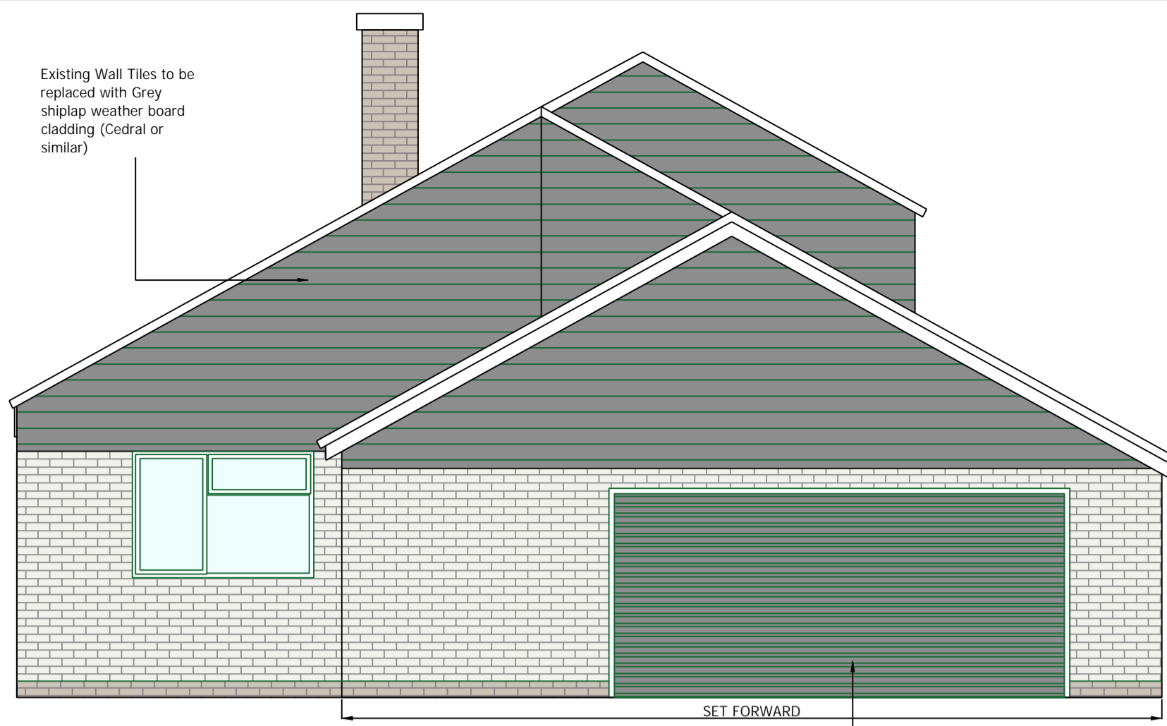
ELEVATION A: FRONT ELEVATION SCALE 1:50@A1