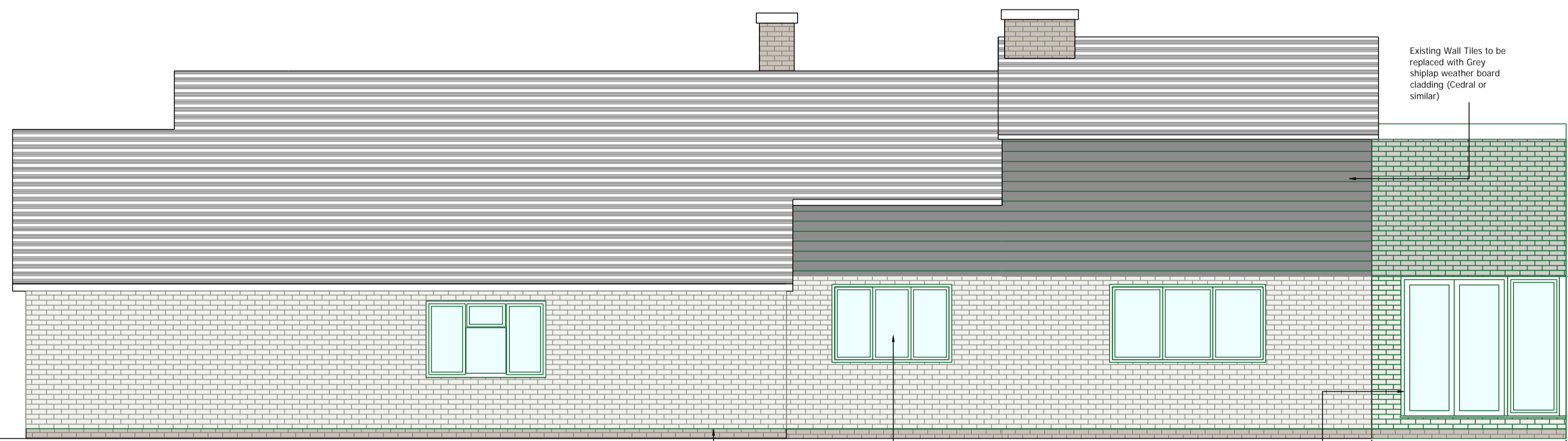
ELEVATION D: SIDE ELEVATION SCALE 1:50@A1