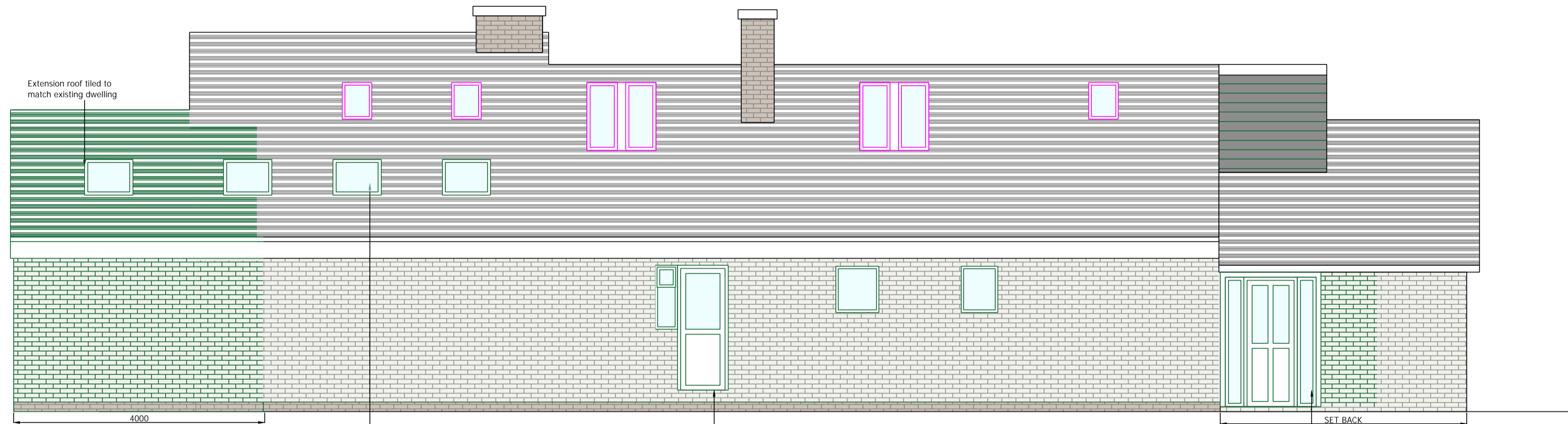
ELEVATION C: SIDE ELEVATION SCALE 1:50@A1