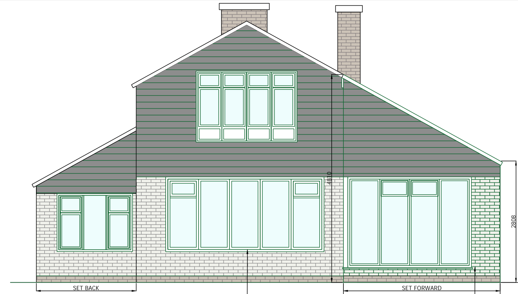
ELEVATION B: REAR ELEVATION SCALE 1:50@A1