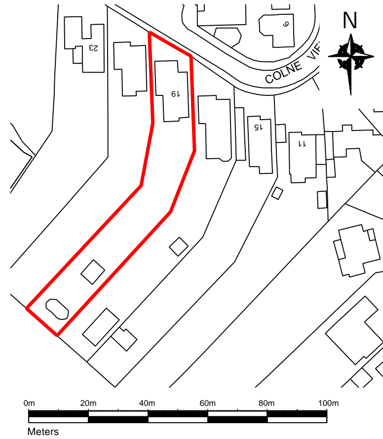
19 COLNE VIEW: LOCATION PLAN SCALE: 1:1250@A3