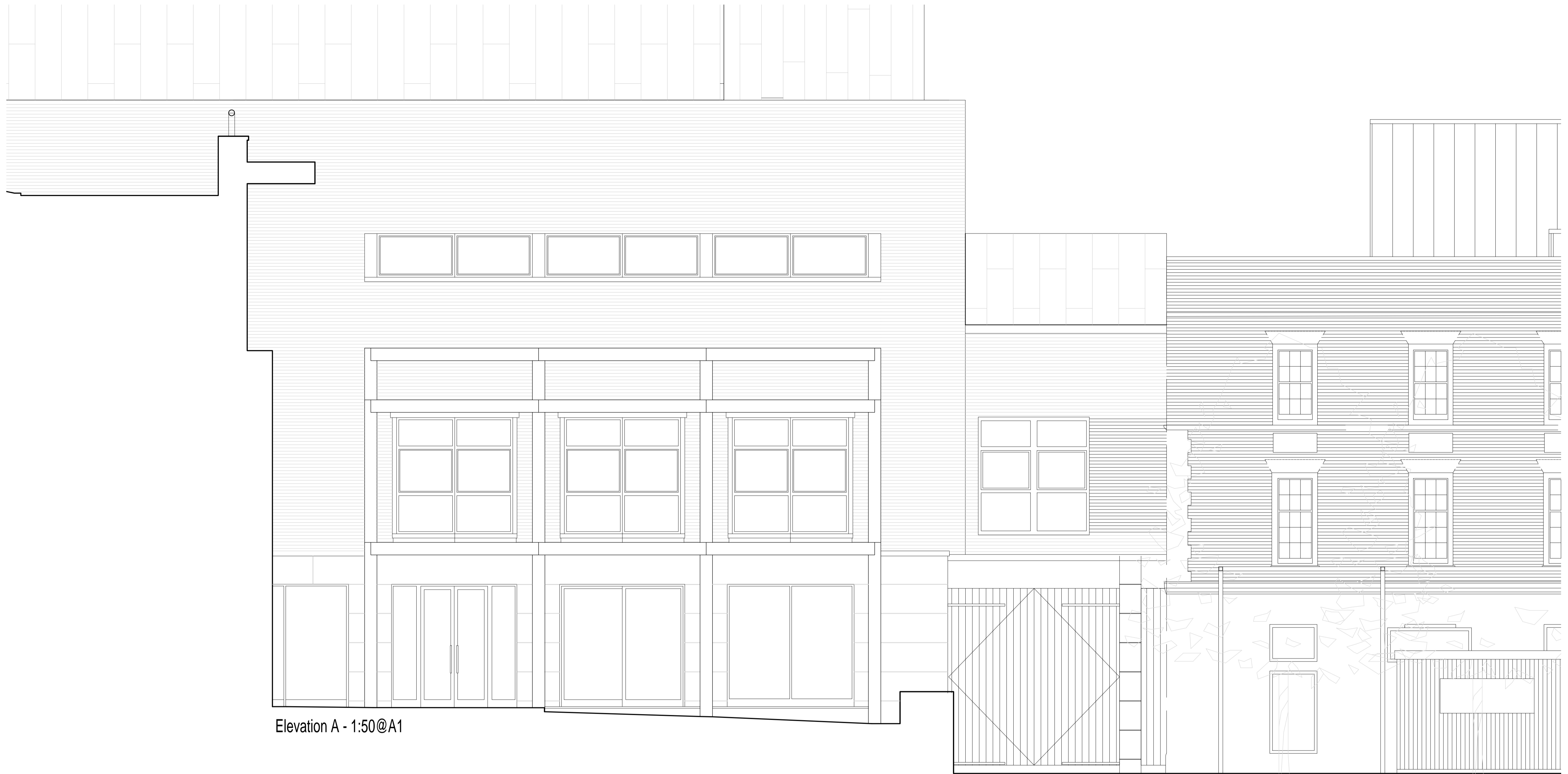
Elevation A - 1:50@A1