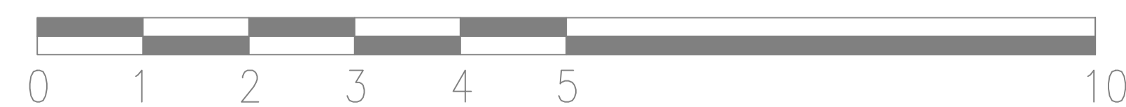
SCALE BAR 1:50