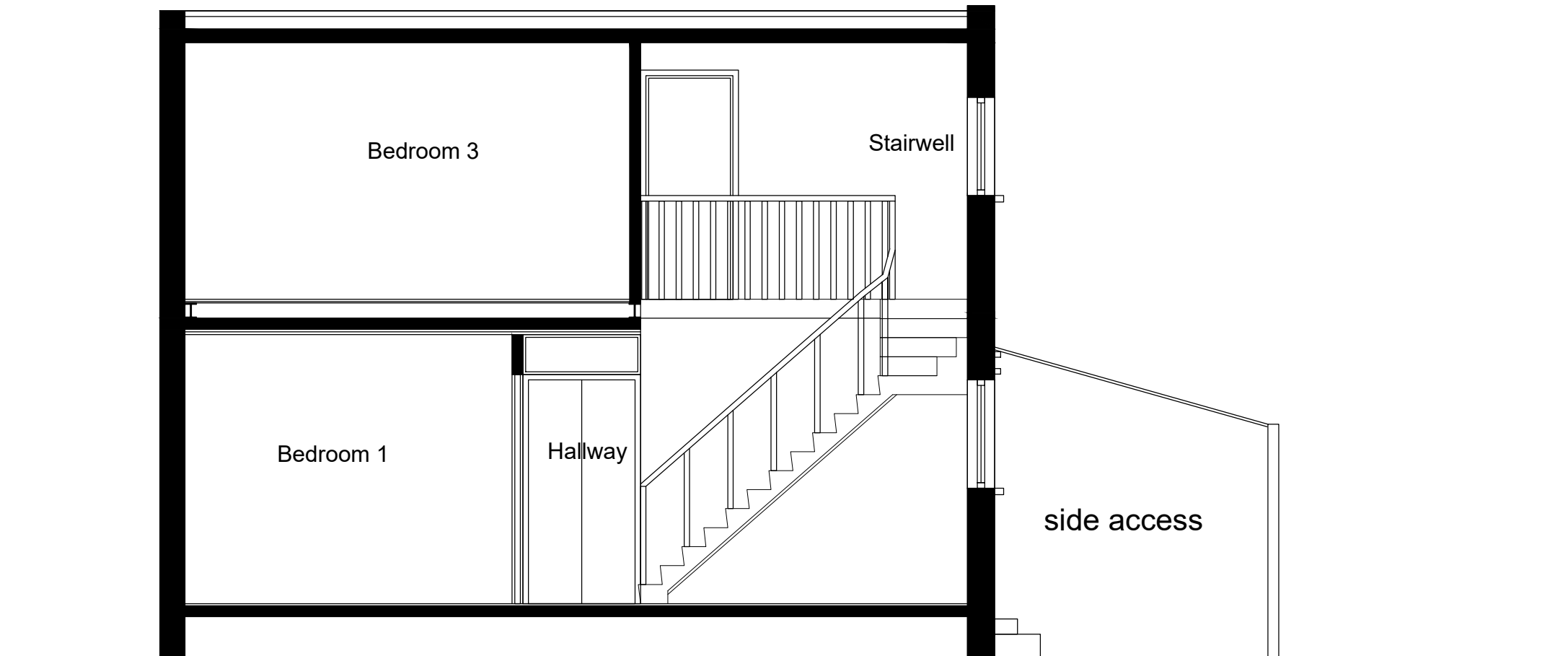
PROPOSED SECTION B-B