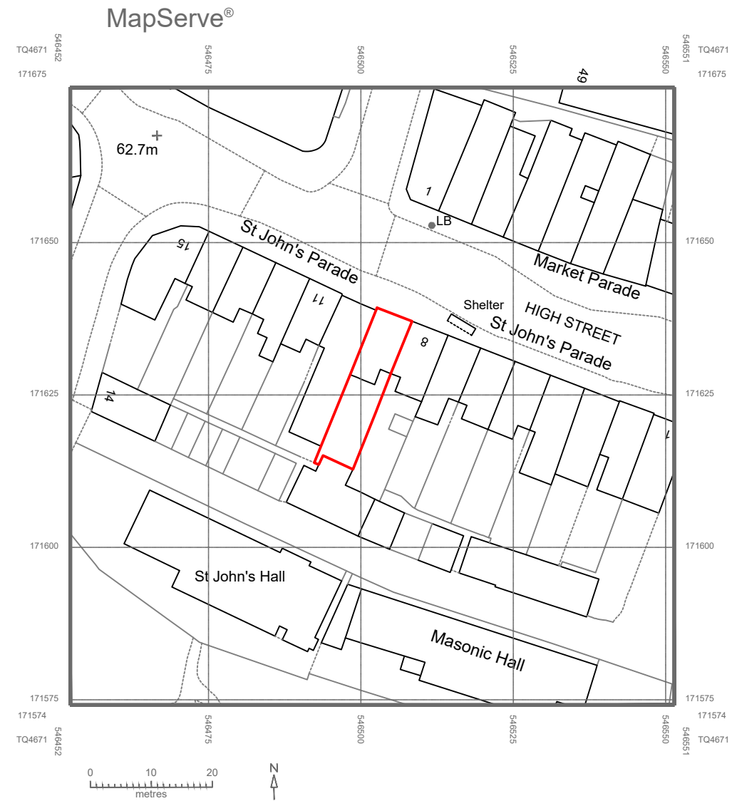
LOCATION PLAN 1:1250 @ A4