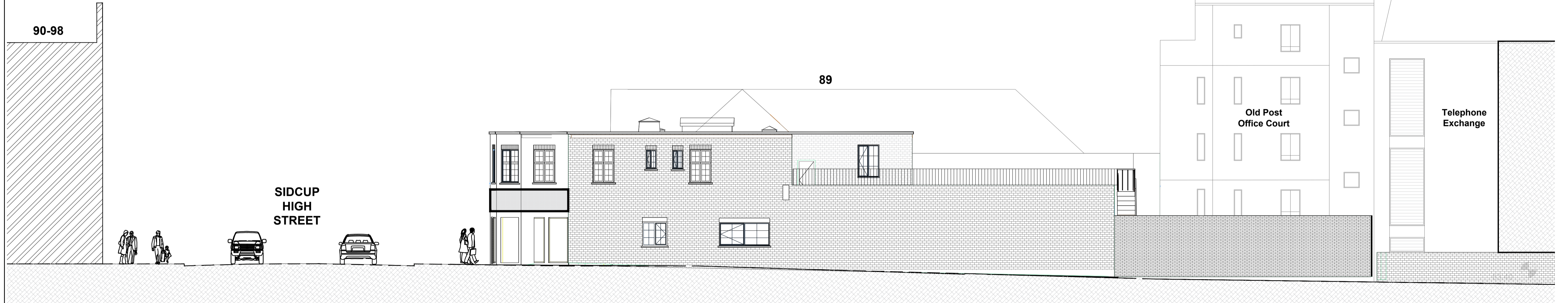
East Elevation, as proposed. Scale 1:100