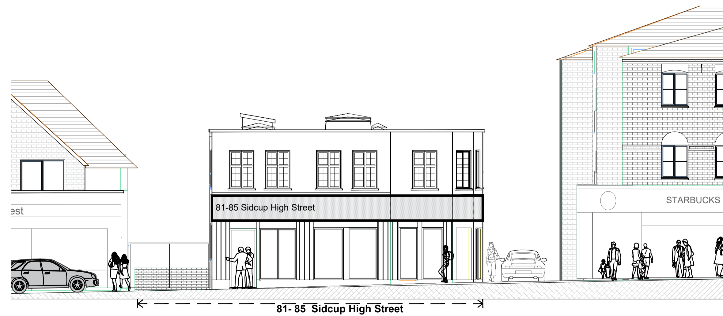
Front Elevation, as proposed. Scale 1:100