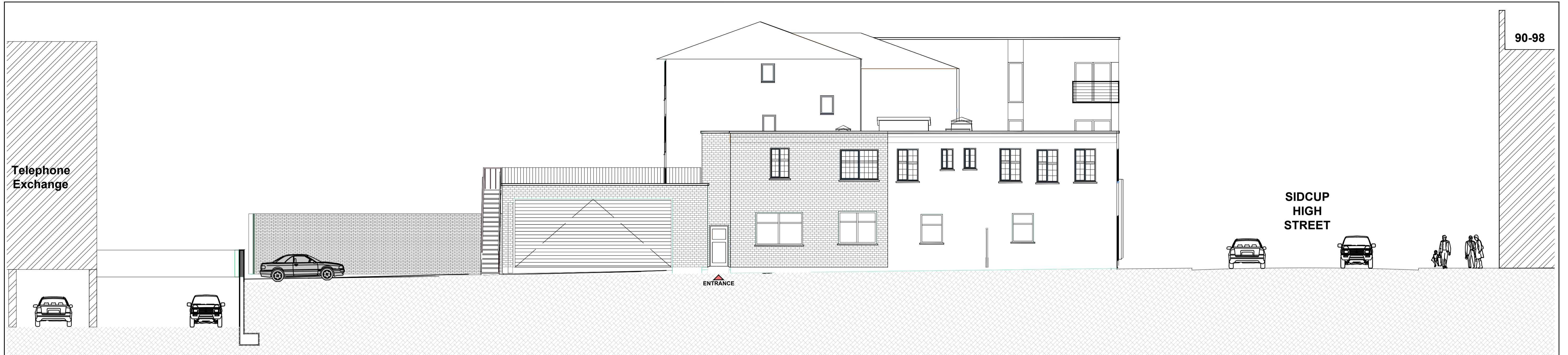
West Elevation, as proposed. Scale 1:100