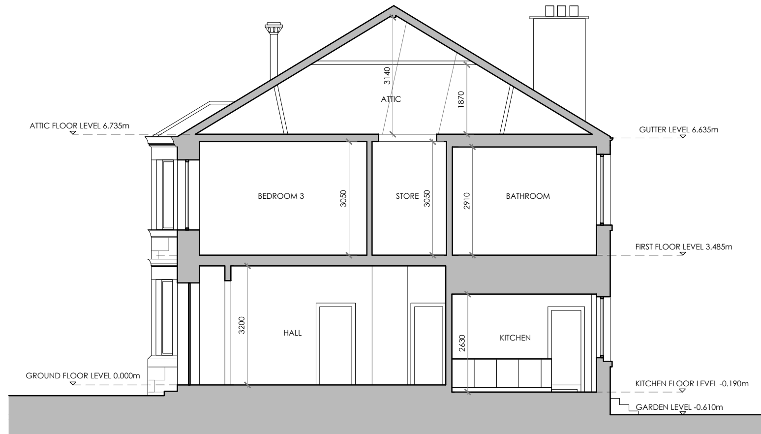
SECTION AA AS EXISTING