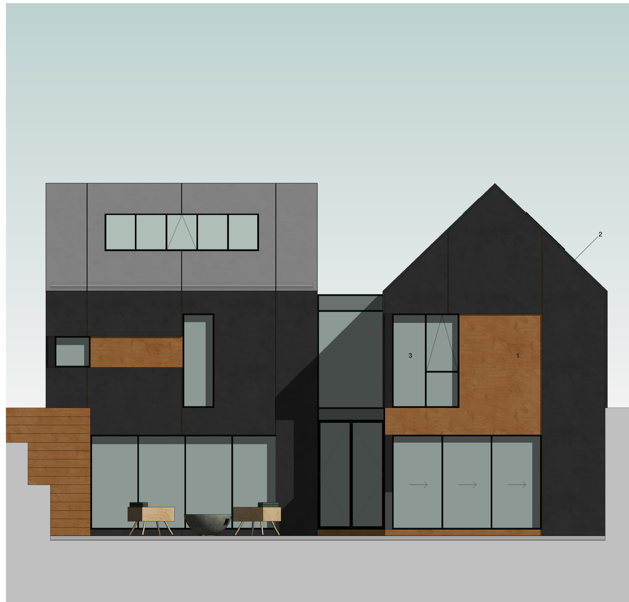
Long Elevation 2 1 : 50