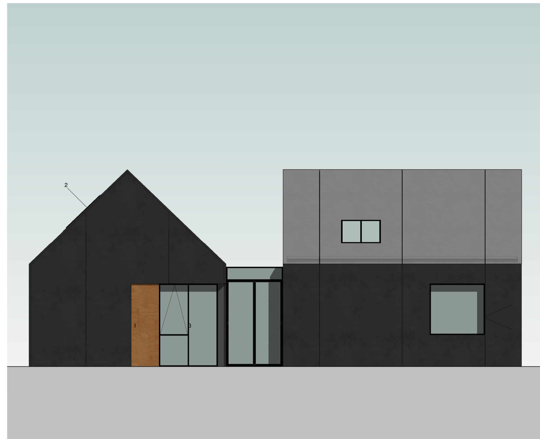
Long Elevation 1 1 : 50