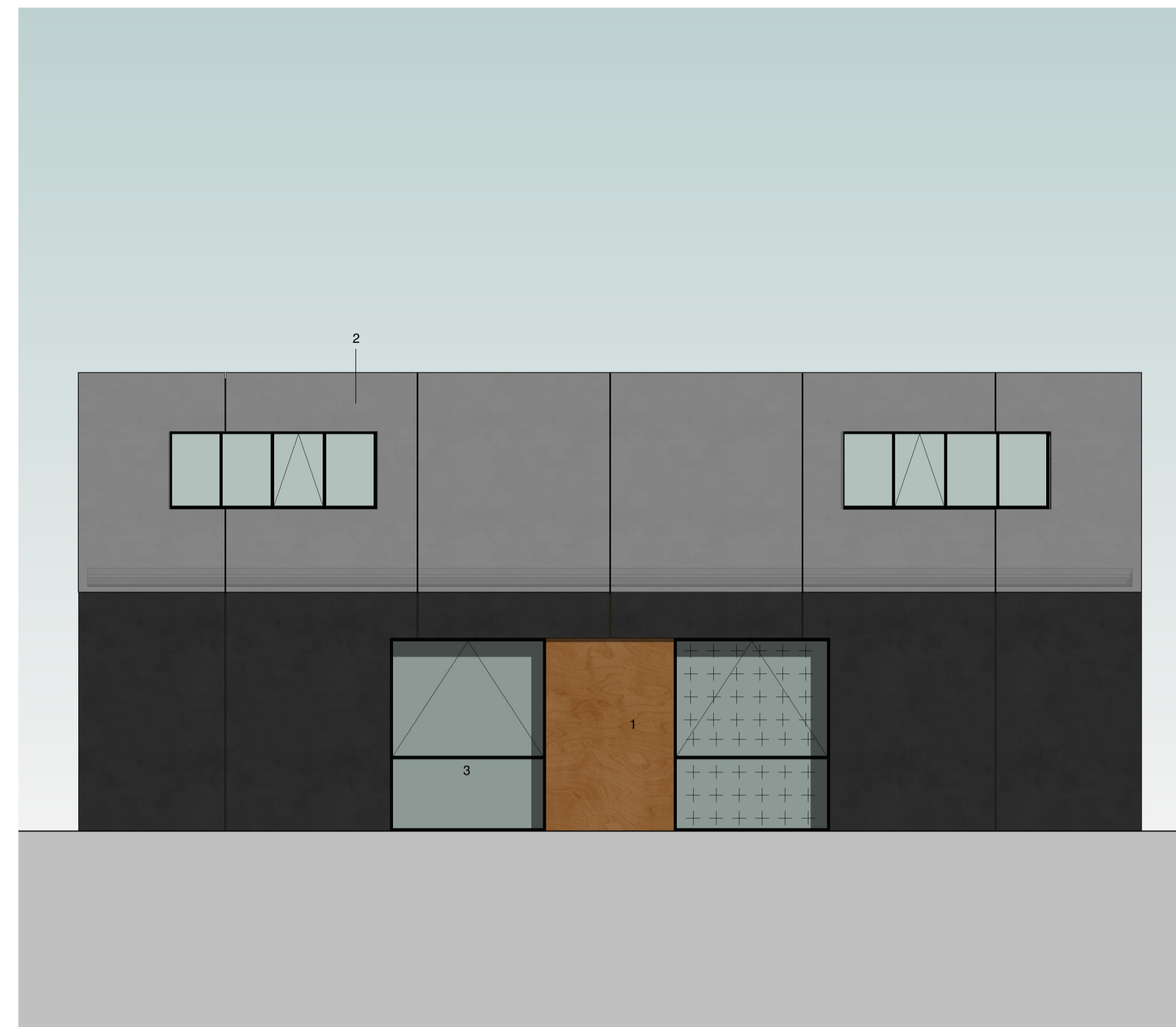
Short Elevation 2 1 : 50