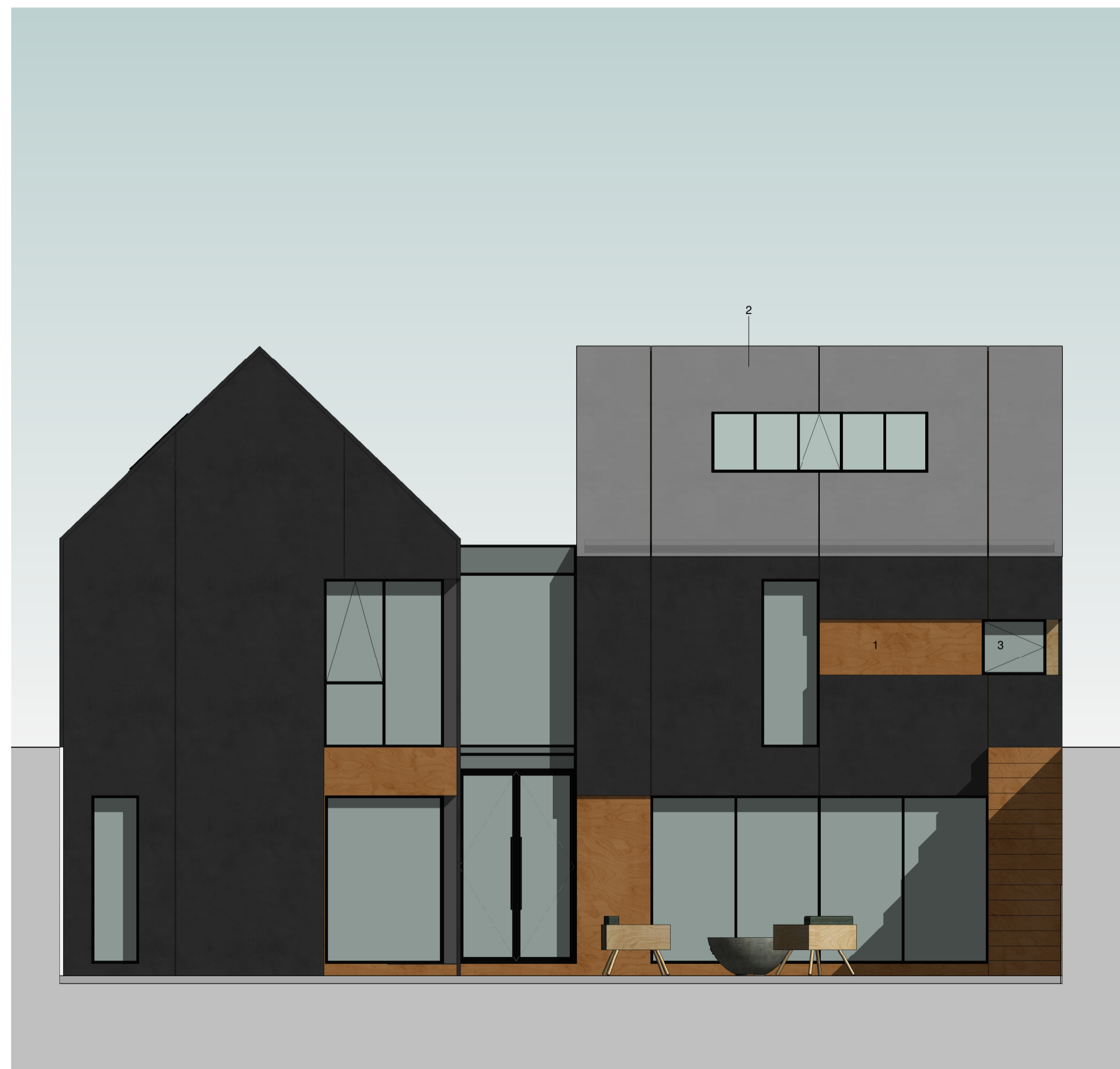
Long Elevation 1 1 : 50