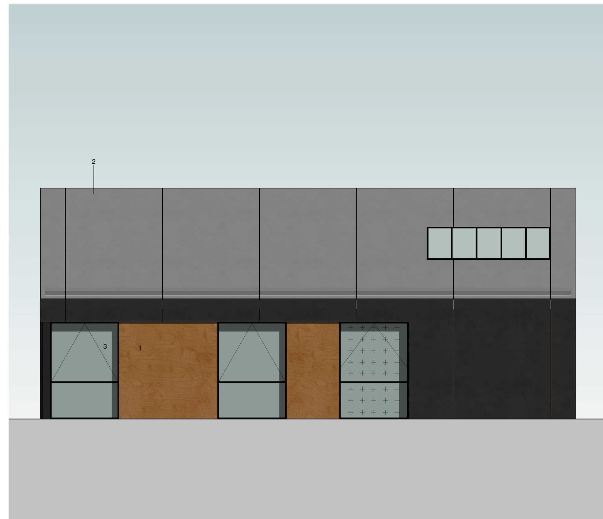
Short Elevation 2 1 : 50