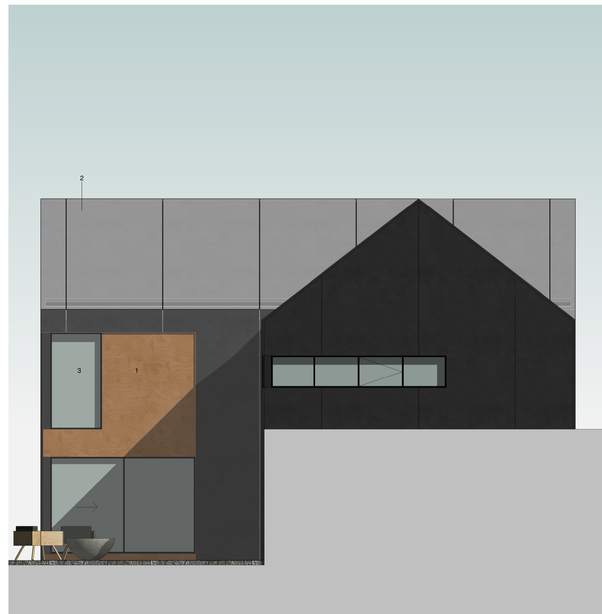
Short Elevation 1 1 : 50