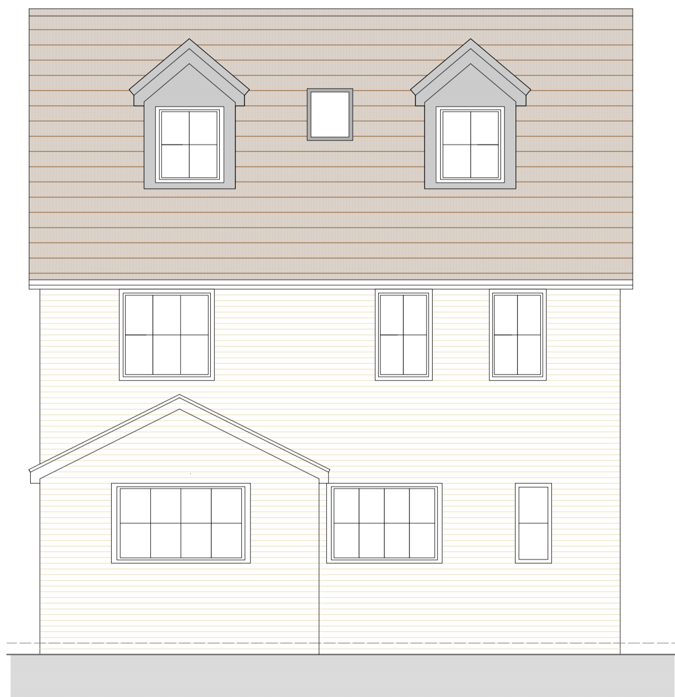
PROPOSED REAR (South) ELEVATION 1:50