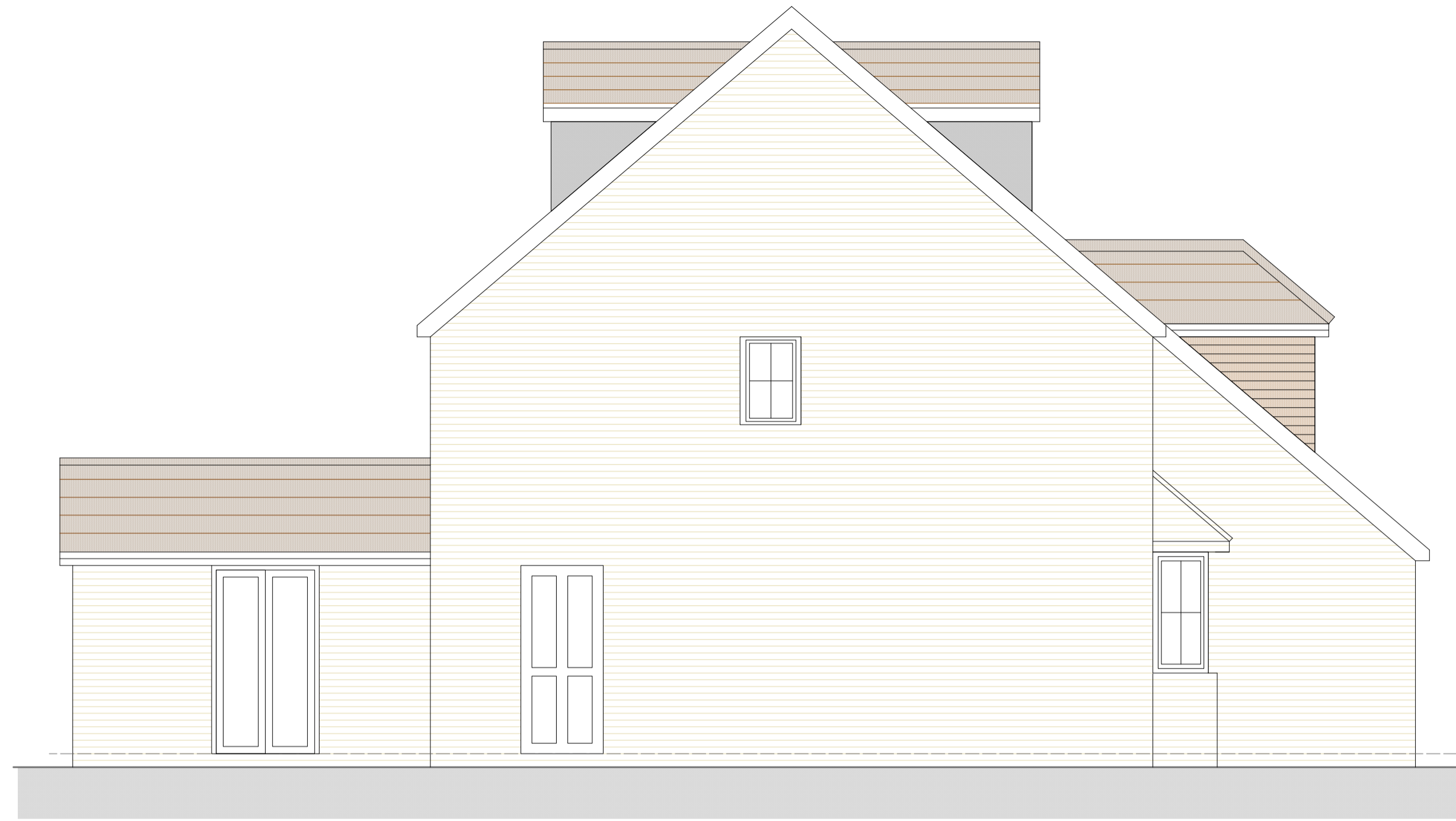
PROPOSED SIDE (East) ELEVATION 1:50