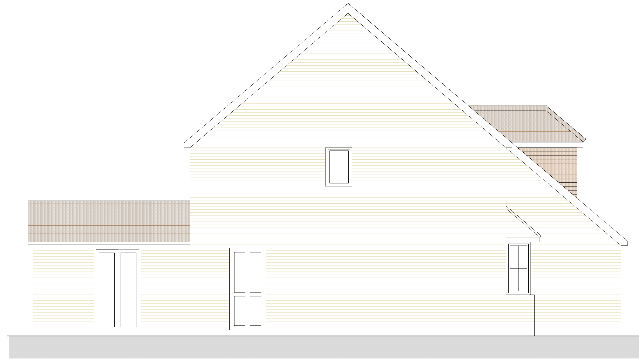
EXISTING SIDE (East) ELEVATION 1:50