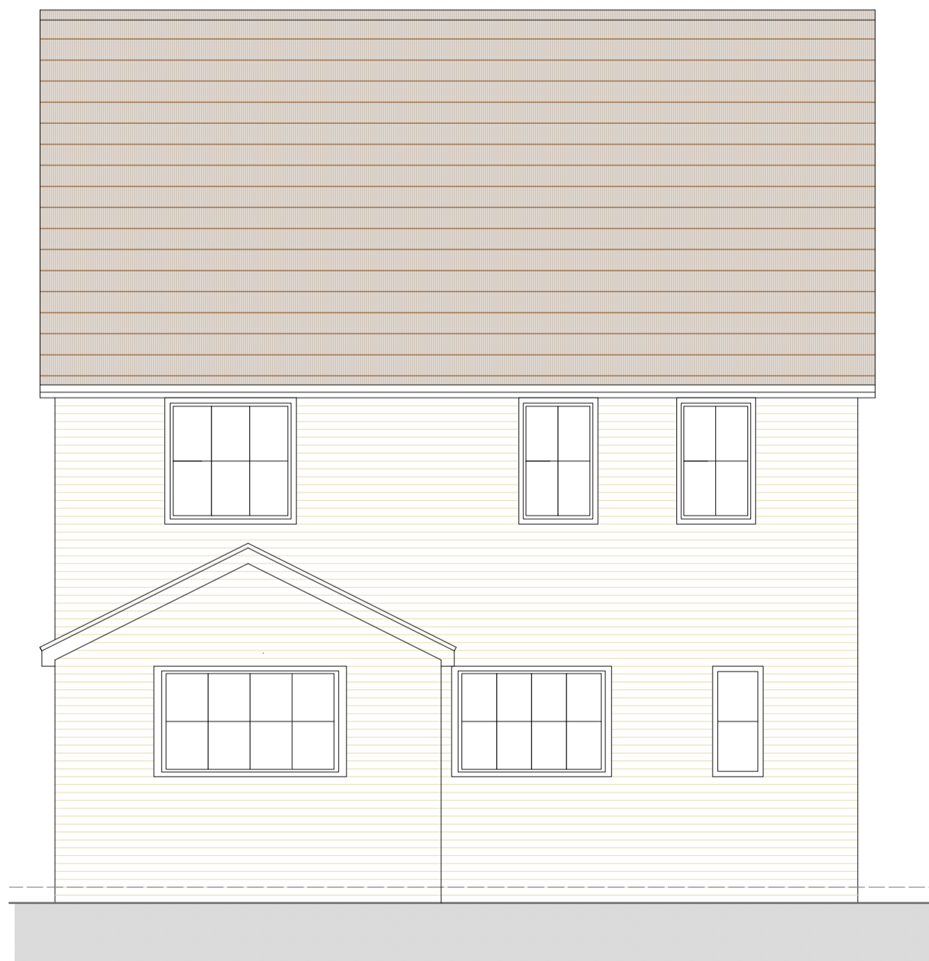
EXISTING REAR (South) ELEVATION 1:50