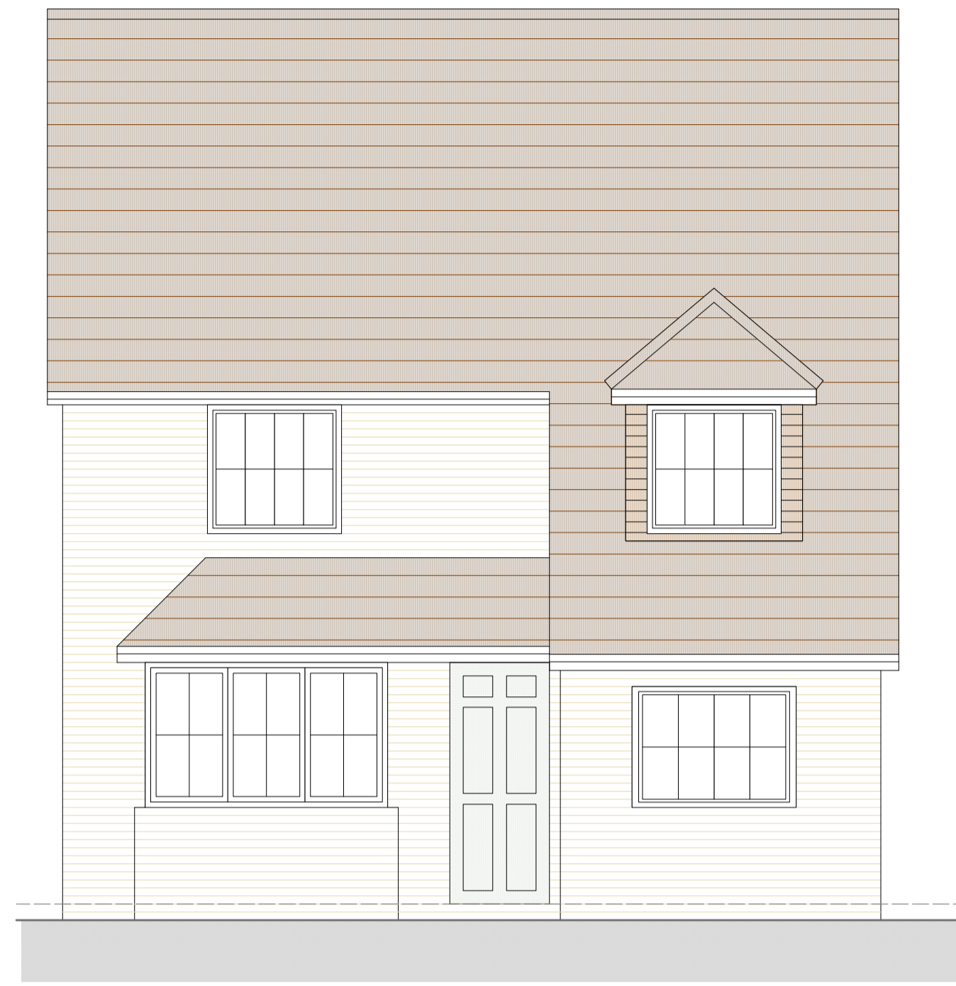
EXISTING FRONT (North) ELEVATION 1:50