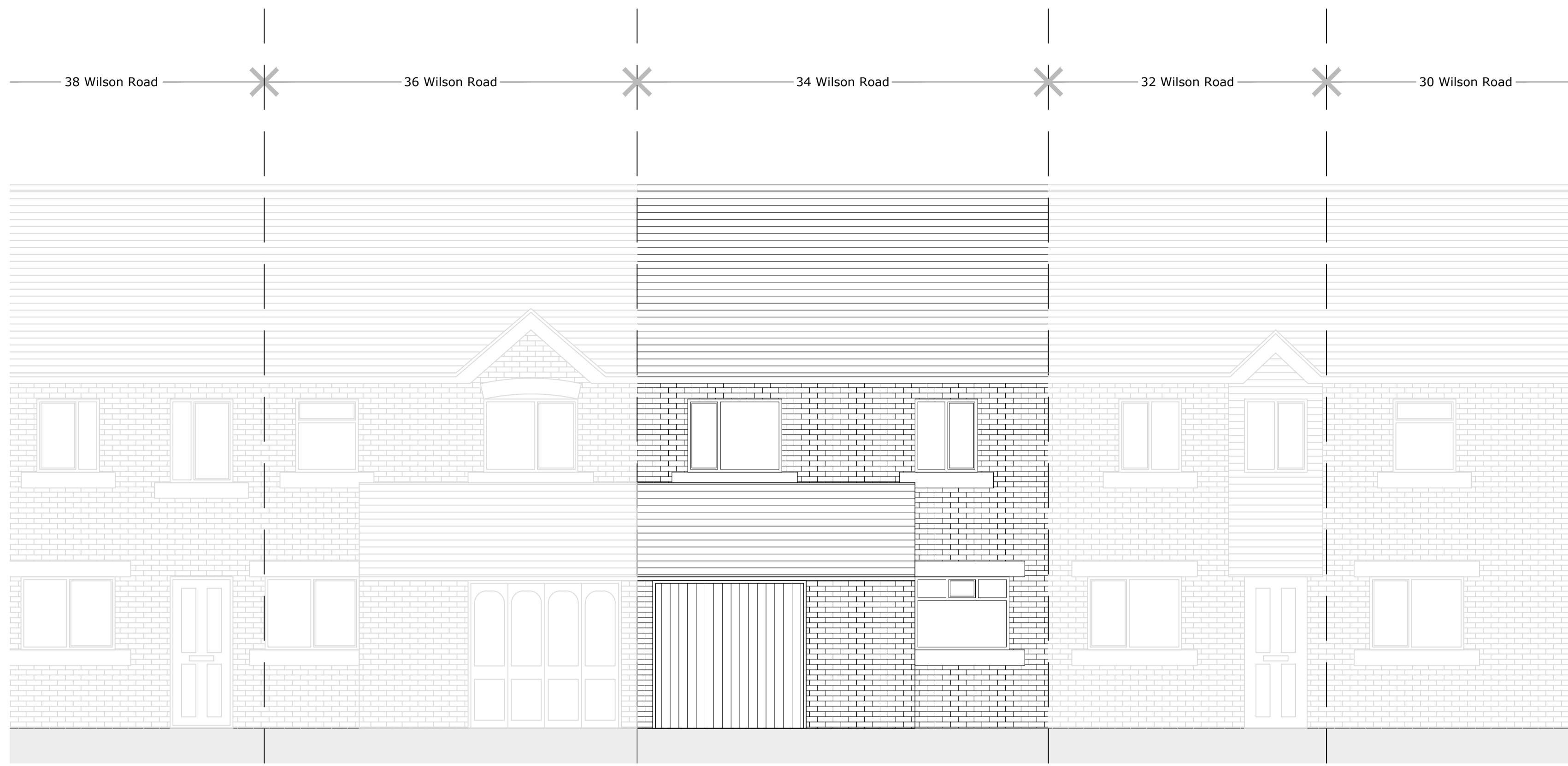
front elevation (north facing) as existing 1:50