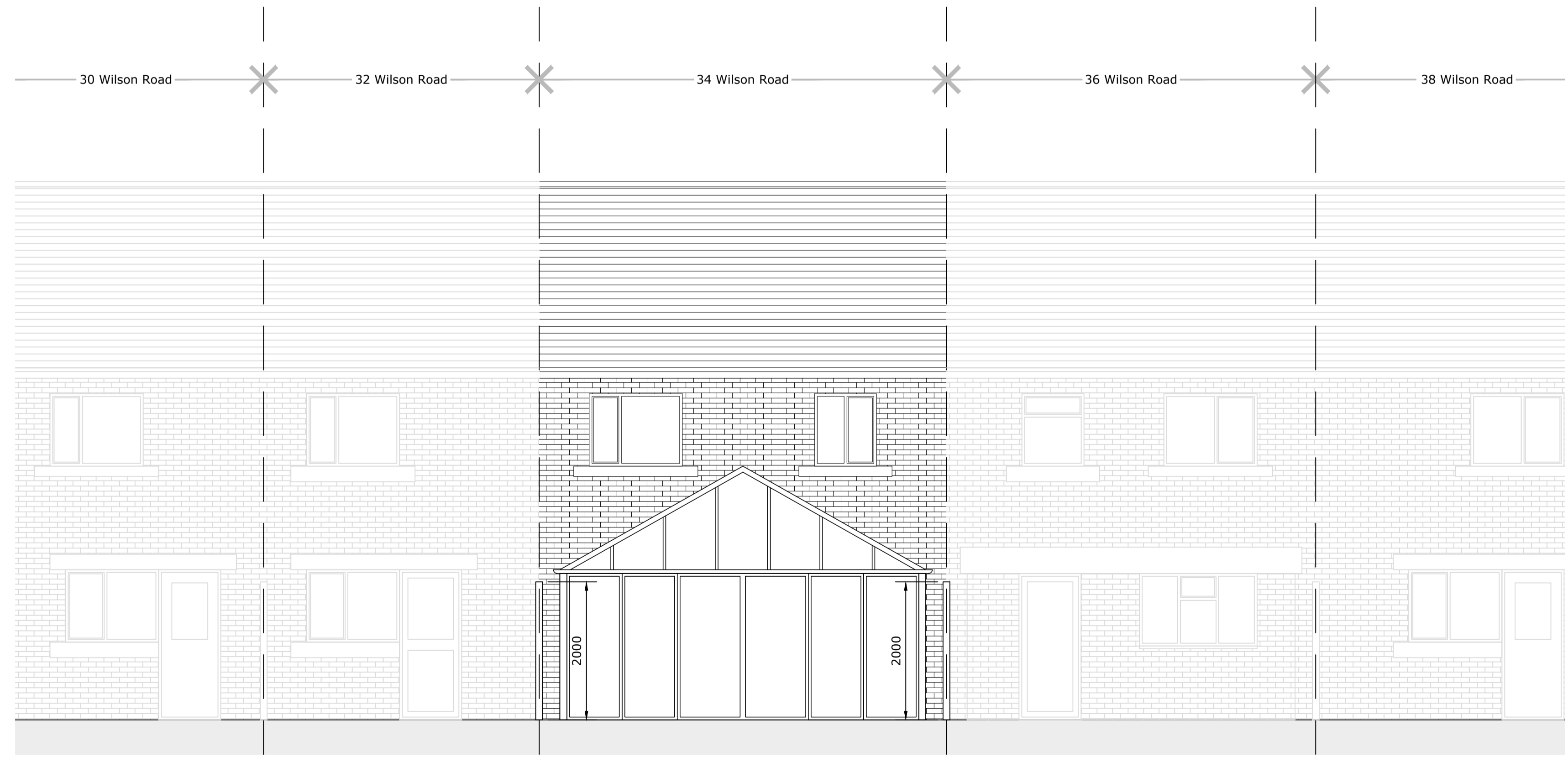
rear elevation (south facing) as existing 1:50