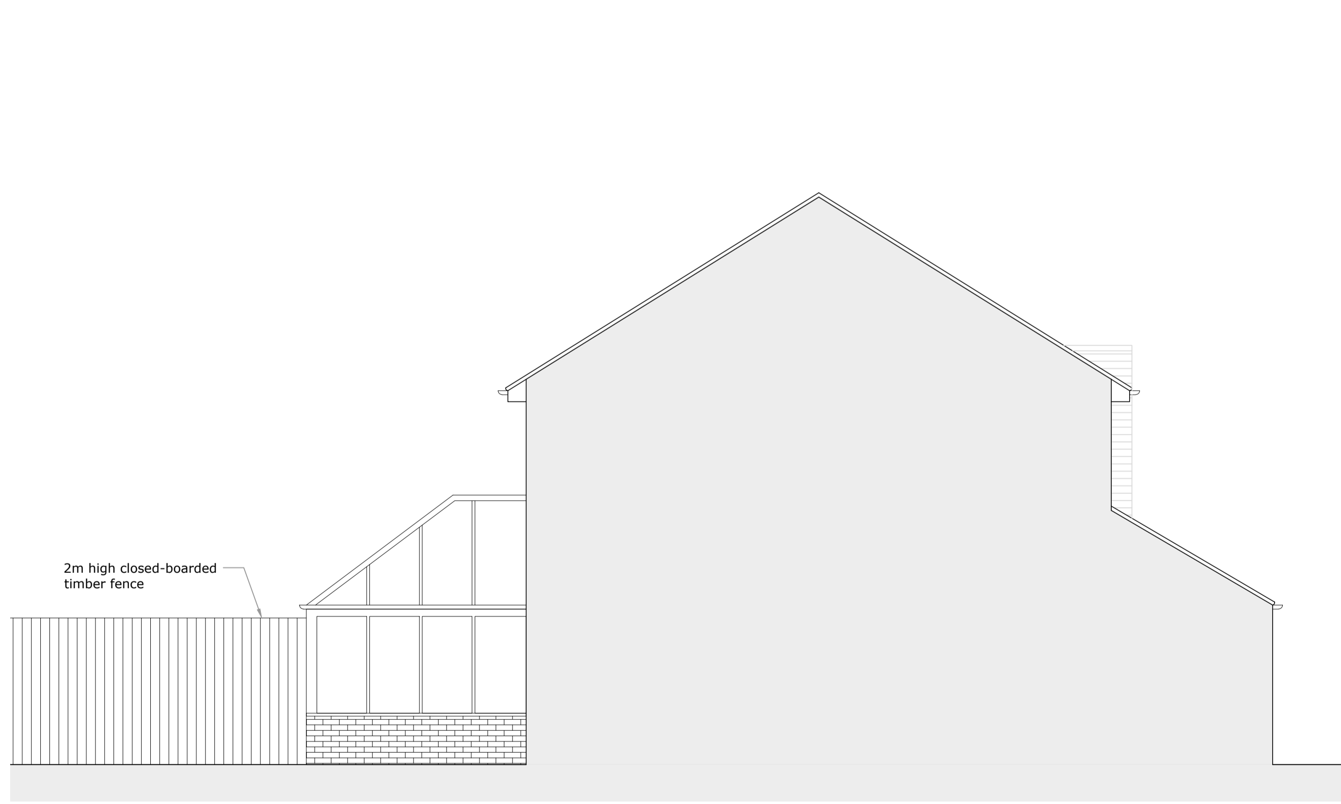
side elevation (east facing) as existing 1:50