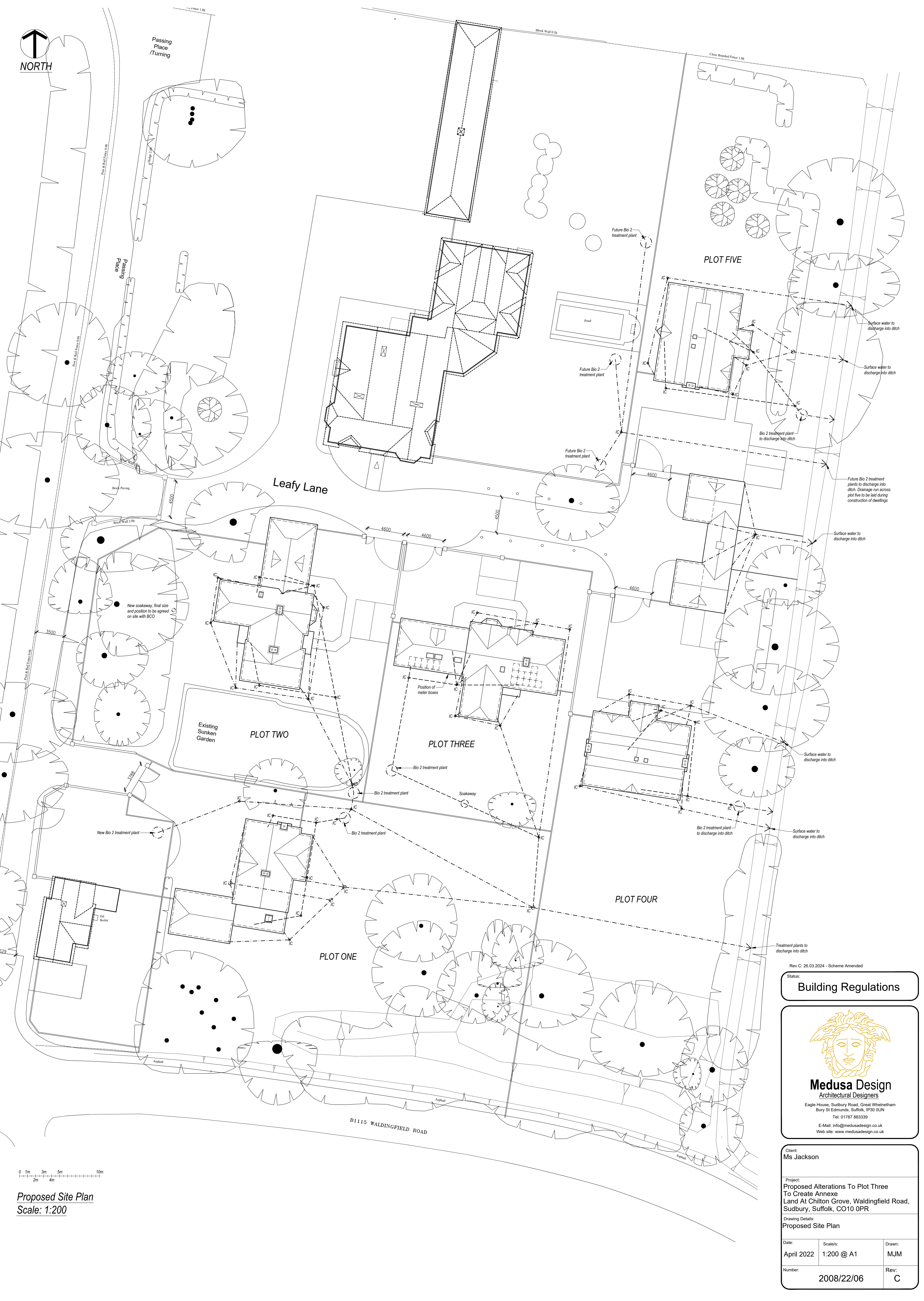
Proposed Site Plan Scale: 1:200