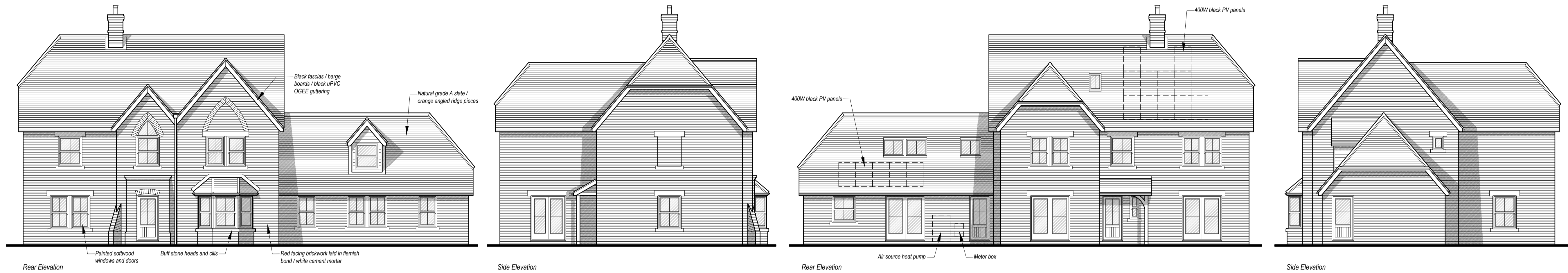
Proposed Elevations Scale: 1:100