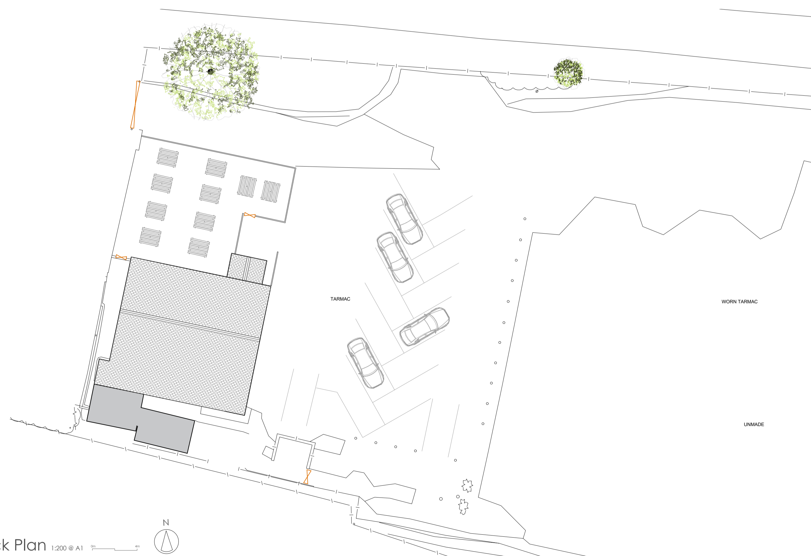
Block Plan 1:200 @ A1

© Metters & Wellby Ltd 2023 All dimensions to be confirmed on site before commencement.