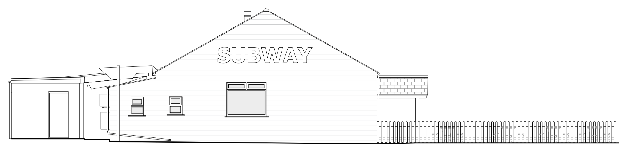
East 1:100 @ A1