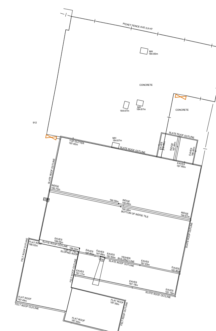
Topographic survey 1:200 @ A1