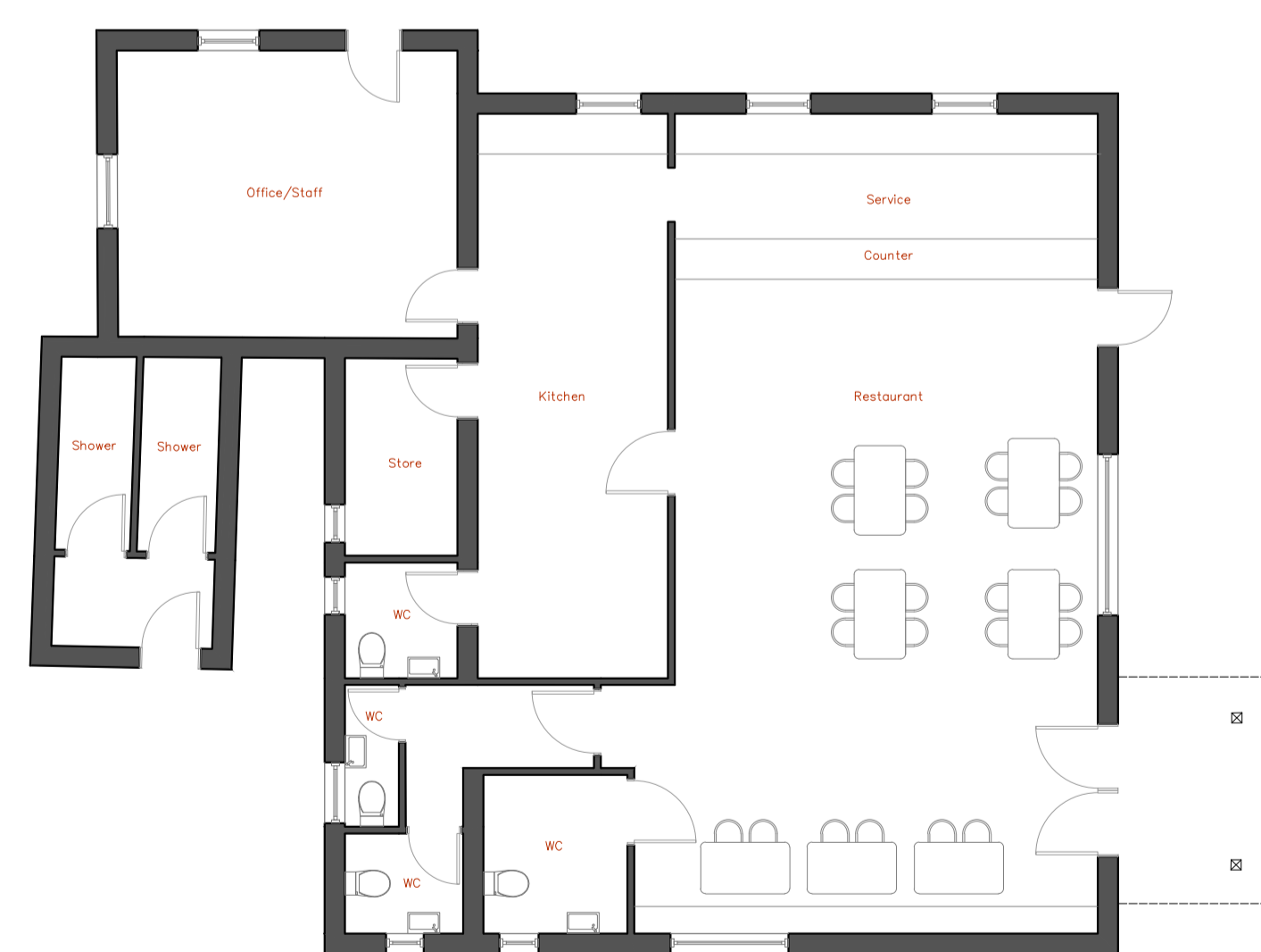
Floor Plan 1:100 @ A1