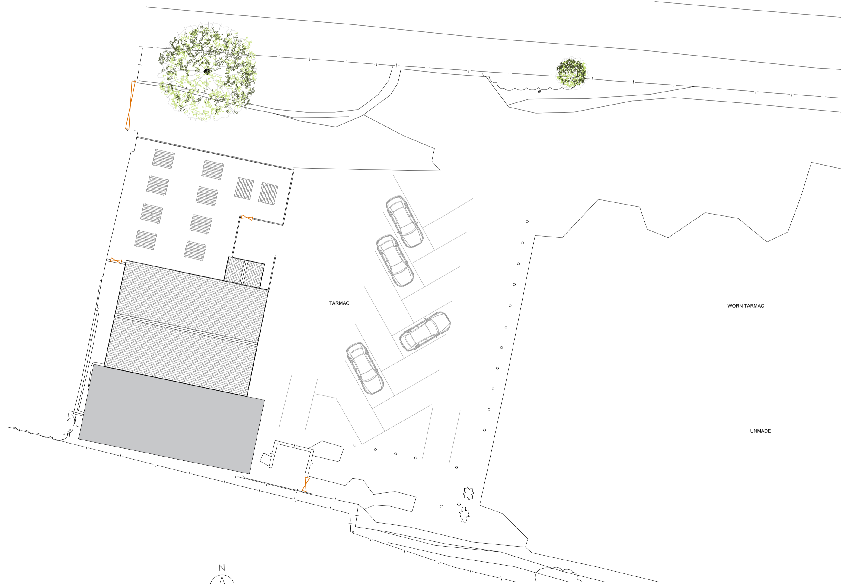
Block Plan 1:200 @ A1

© Metters & Wellby Ltd 2024 All dimensions to be confirmed on site before commencement.