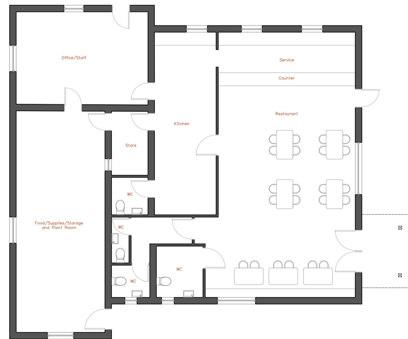
Floor Plan 1:100 @ A1