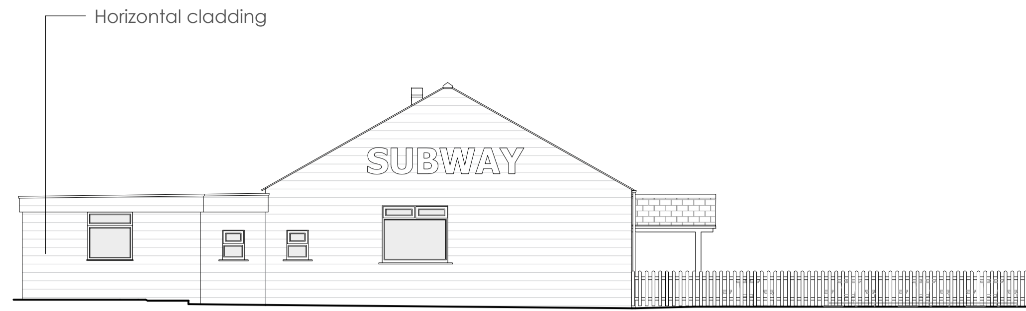
East 1:100 @ A1