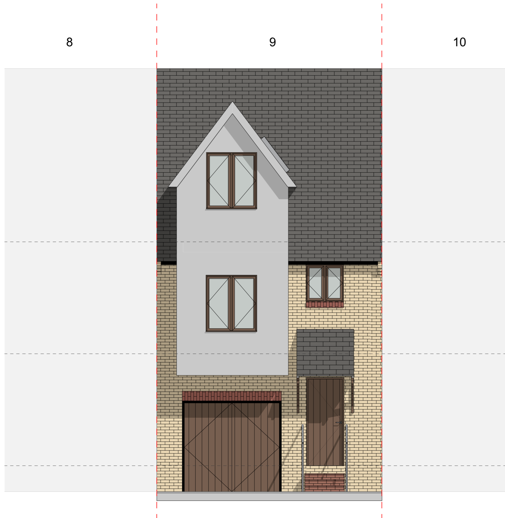
E-01 Elevation Scale: 1:50