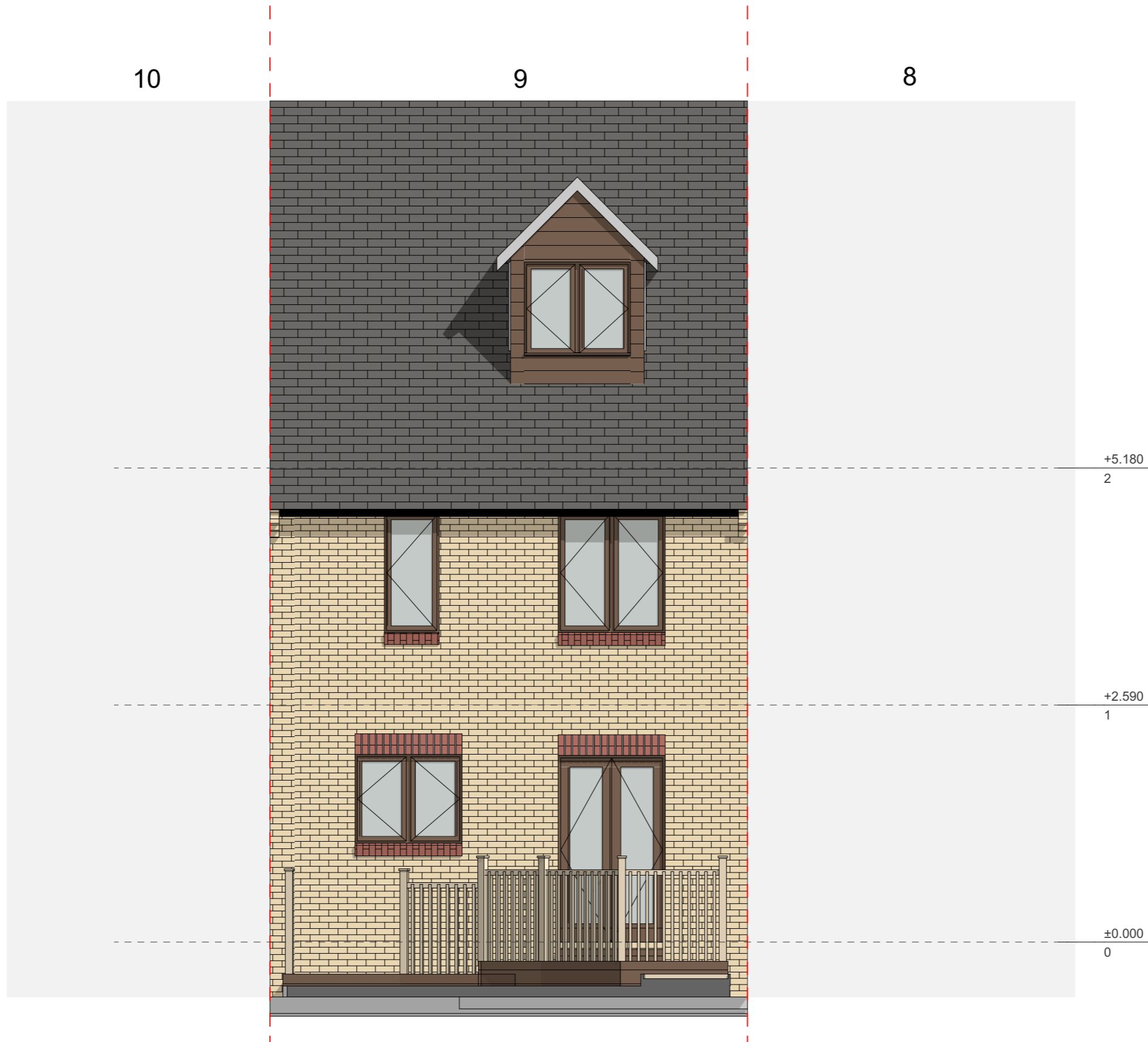
E-02 Elevation Scale: 1:50