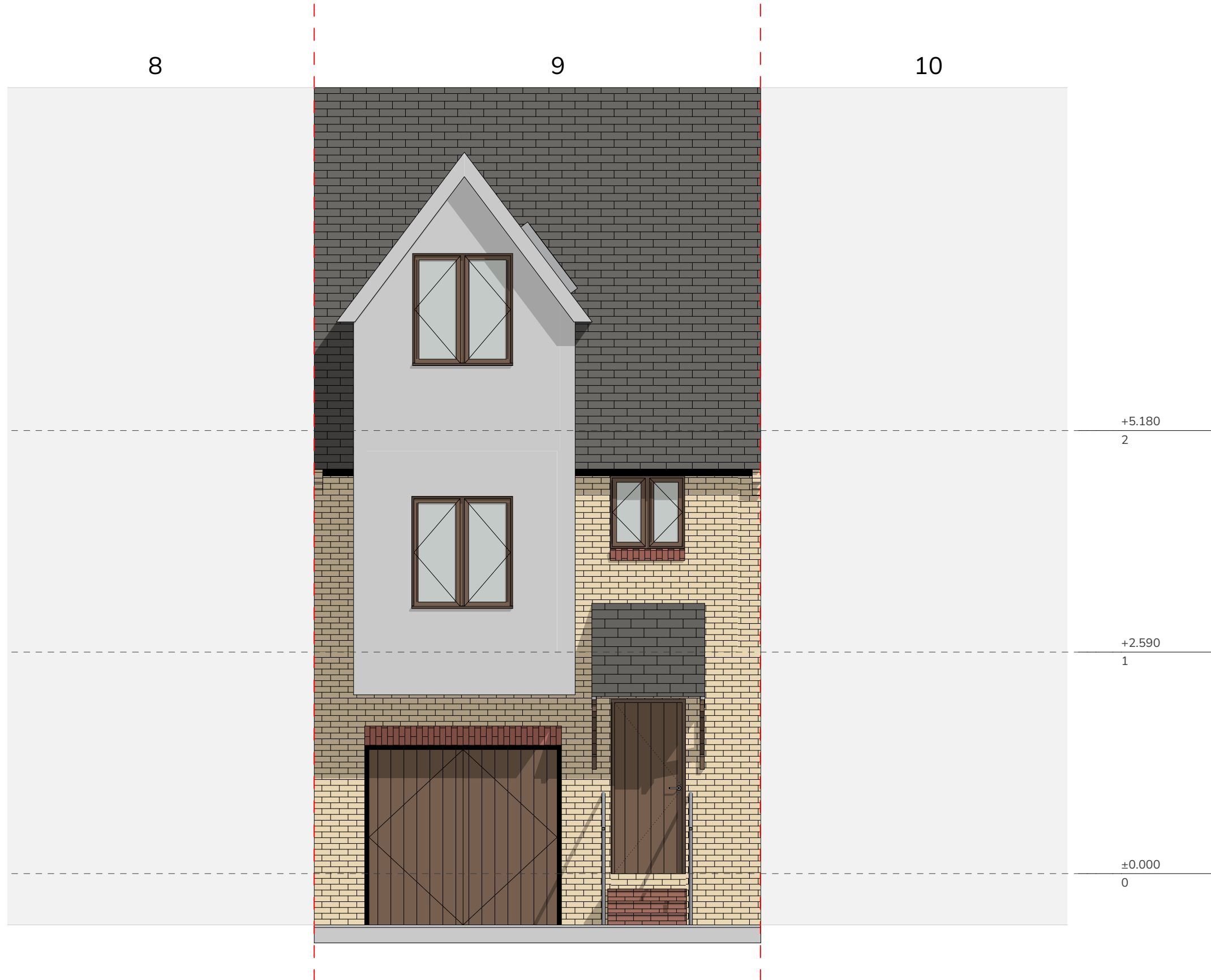
E-01 Elevation Scale: 1:50