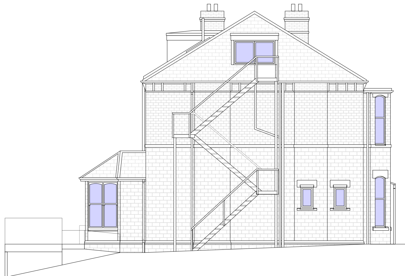
EXISTING SIDE (NORTH) ELEVATION