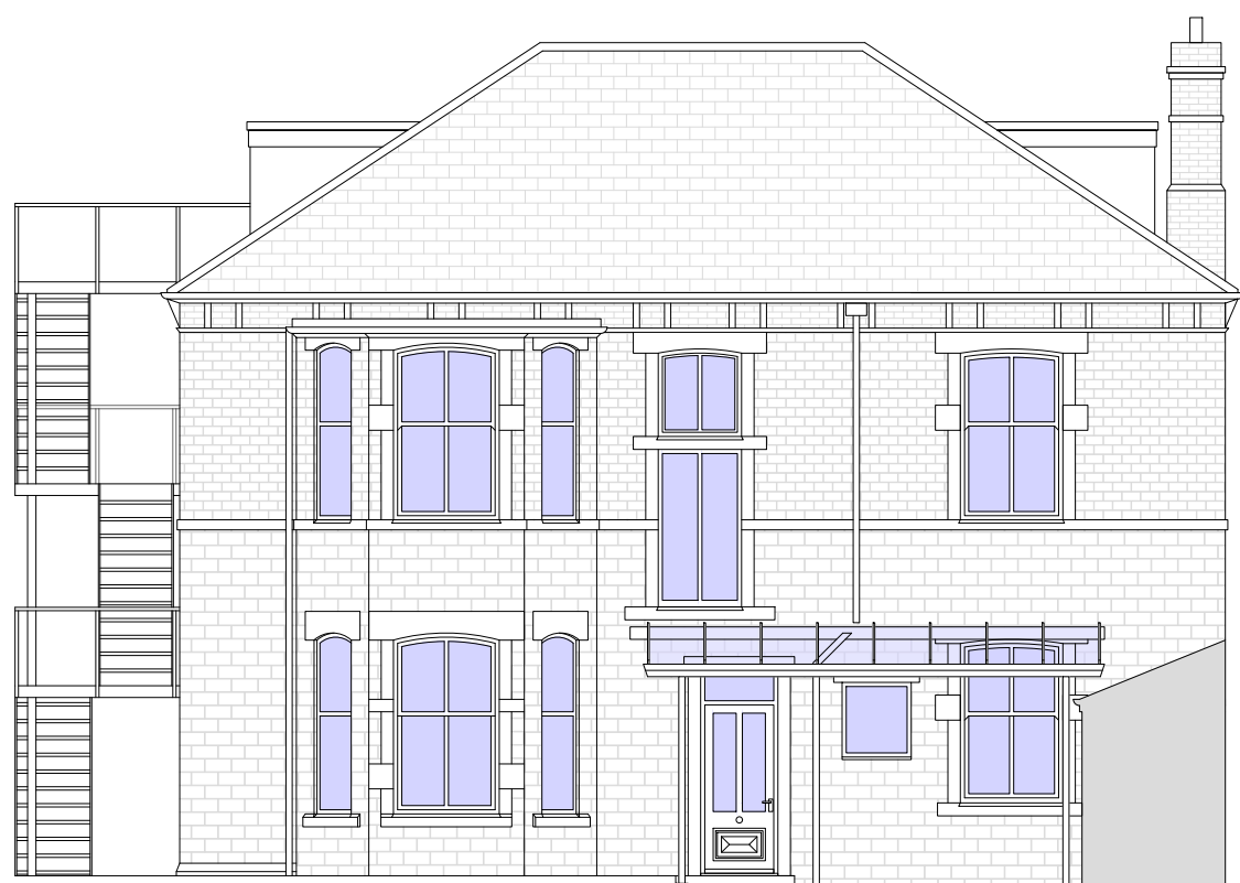
EXISTING FRONT (WEST) ELEVATION