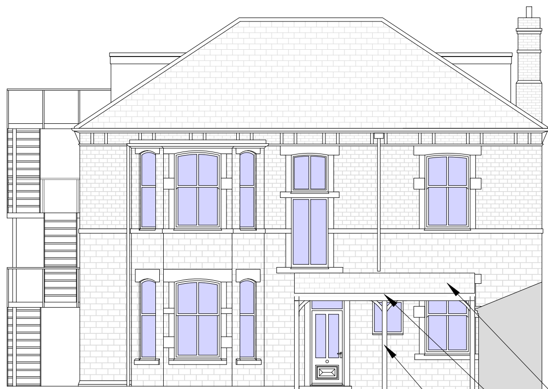
PROPOSED FRONT (WEST) ELEVATION

Roof covering to be reused slates from the demolished rear extension