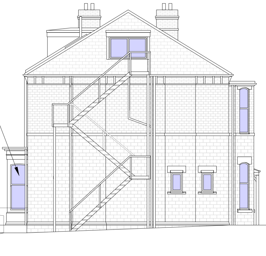
PROPOSED SIDE (NORTH) ELEVATION

Stonework below bay window reused from demolished extension