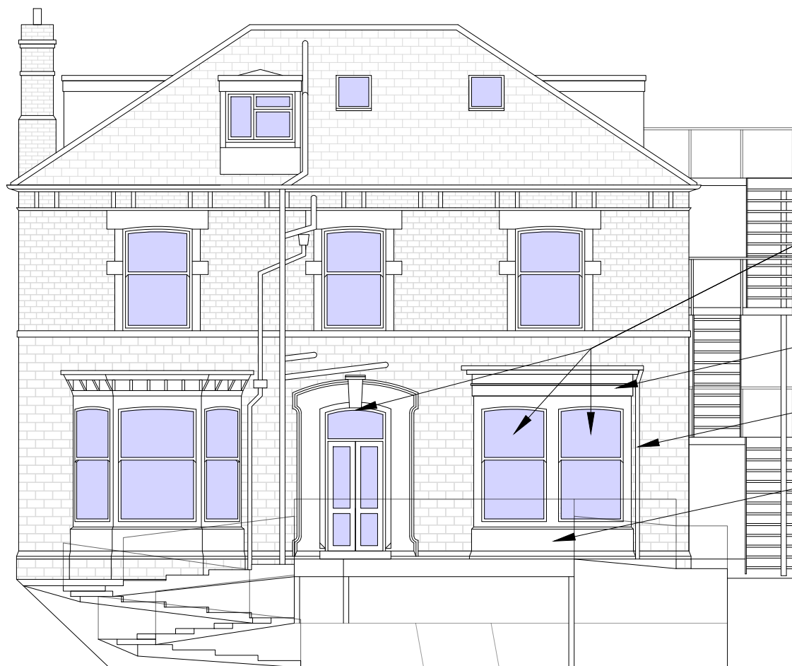
PROPOSED REAR (EAST) ELEVATION

Dimensions should be checked and verified on site prior to any construction or alteration.