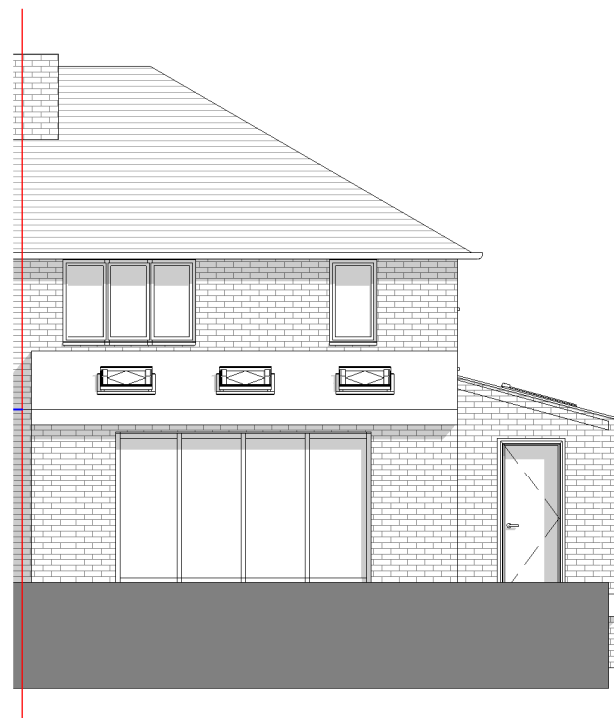
Existing Rear Elevation 1 : 100