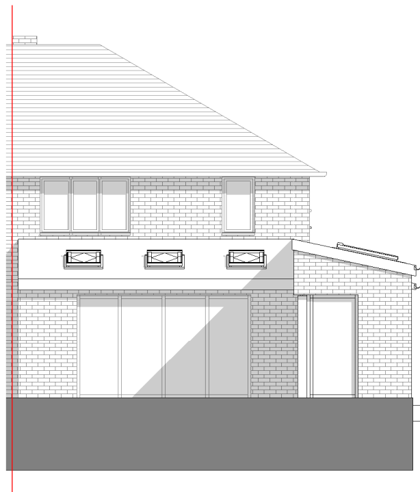
Proposed Rear Elevation 1 : 100