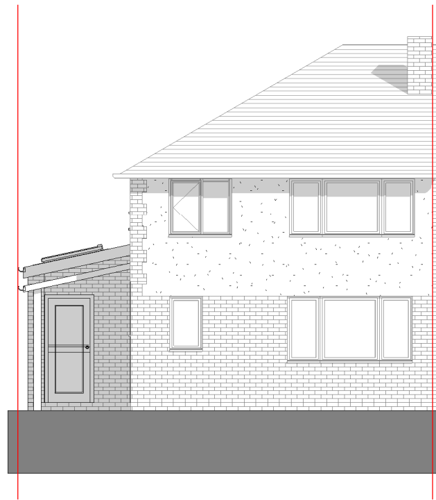
Proposed Front Elevation 1 : 100