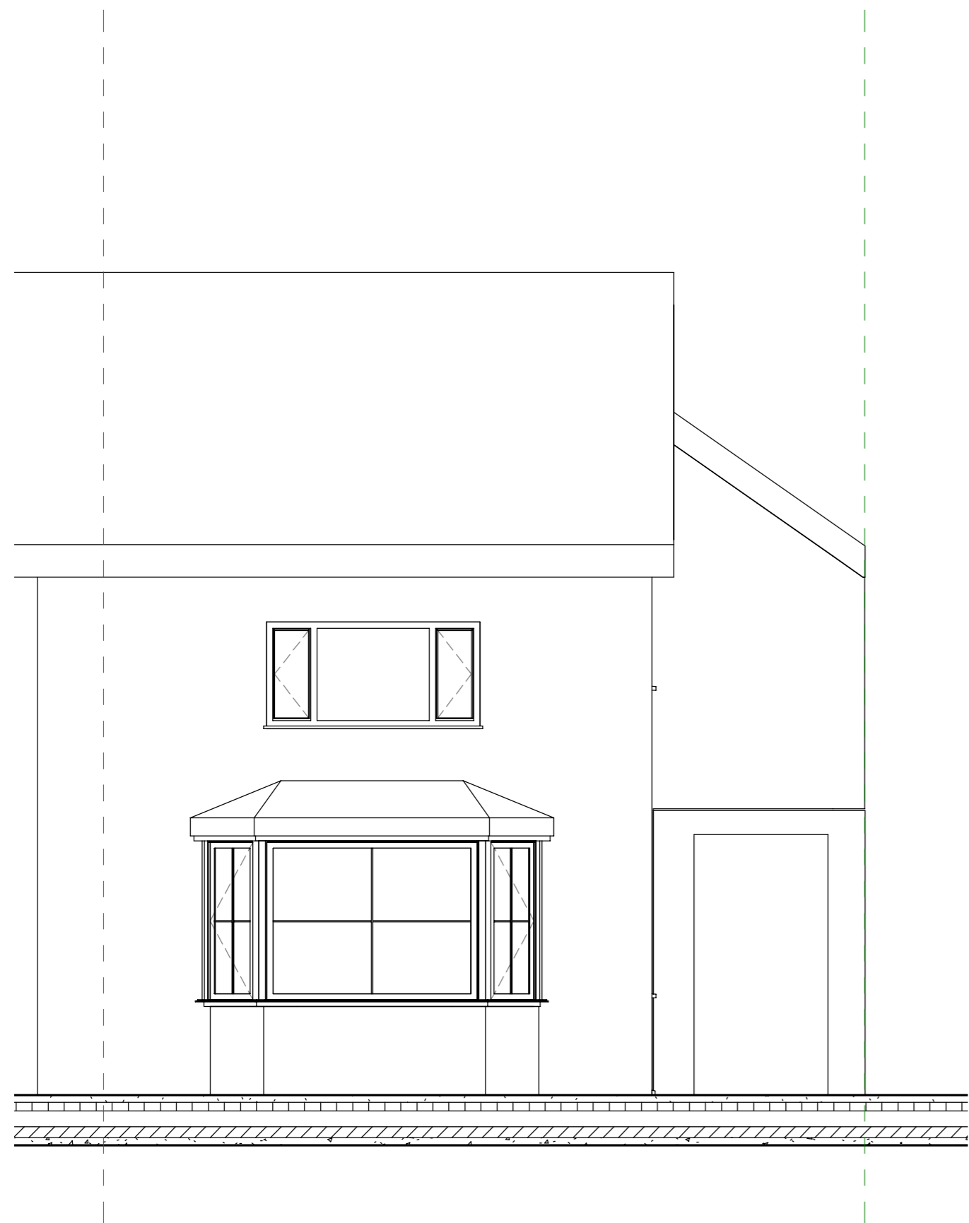
1 P4-Proposed Front Elevation 1 : 50