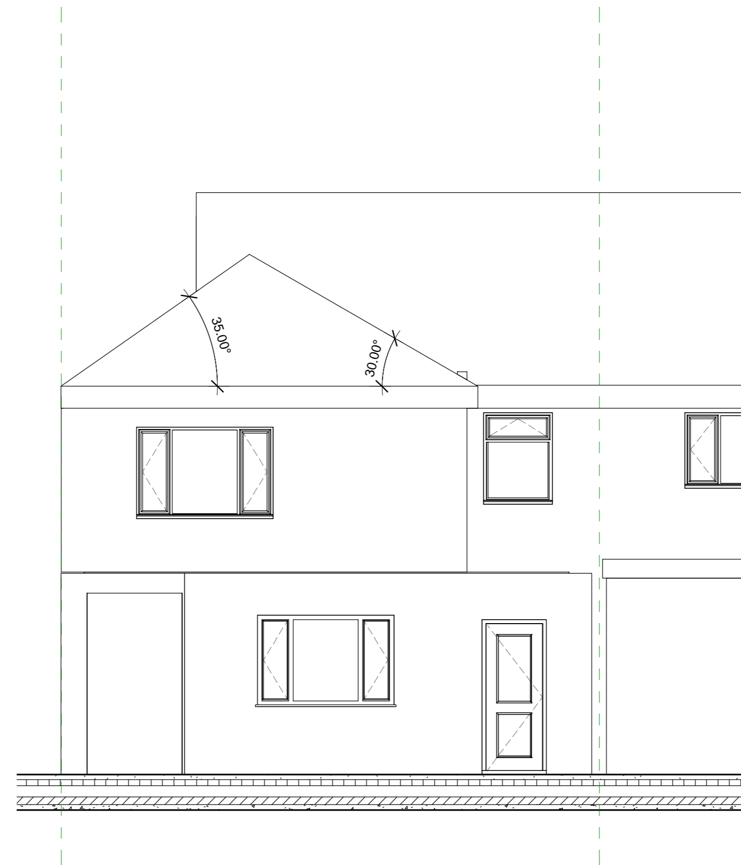
2 P4-Proposed Rear Elevation 1 : 50