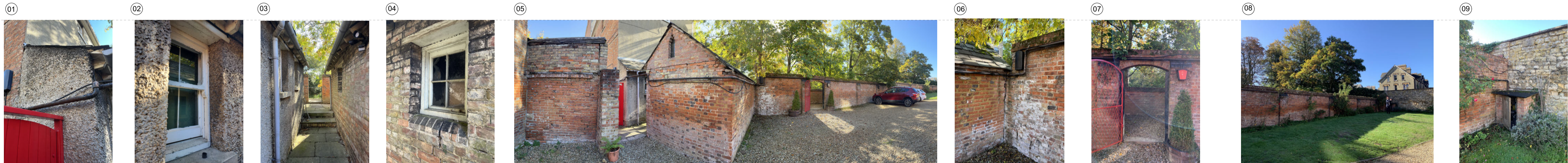
01 View of 20th c. WC extension with cementitious render